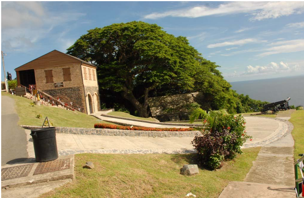
Fort King George Walkways