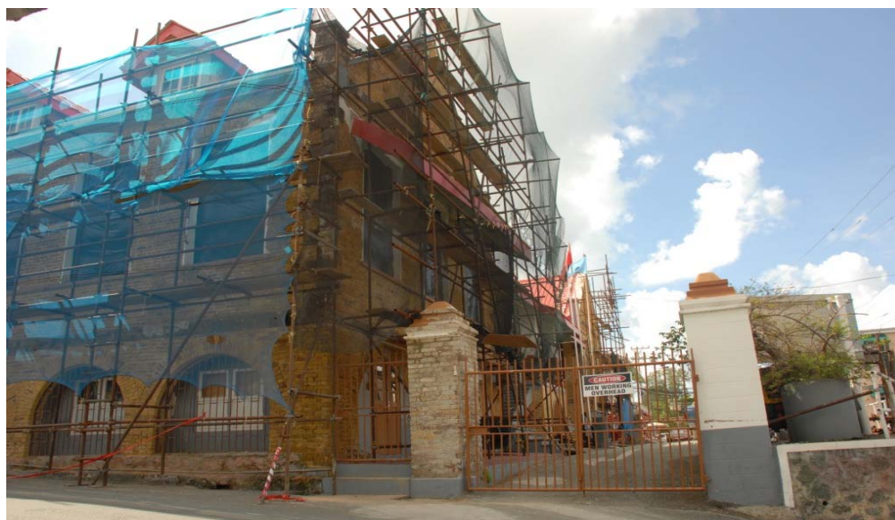
Old Administration Building undergoing Restoration works