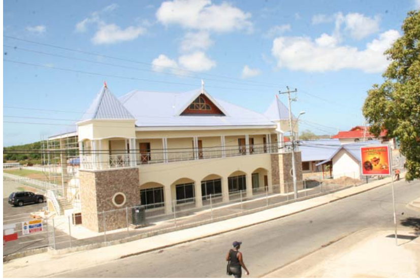
The Buccoo Integrated Facility