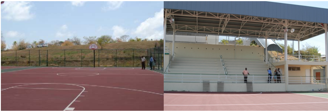
Patience Hill Outdoor Sporting Complex

57. Given the increasing influence of the media in shaping and moulding the minds of the youth and cultivating healthy values and attitudes, the Youth Power Programme has been conducted to highlight positive aspects of youth and disseminate information on critical issues which affect them.