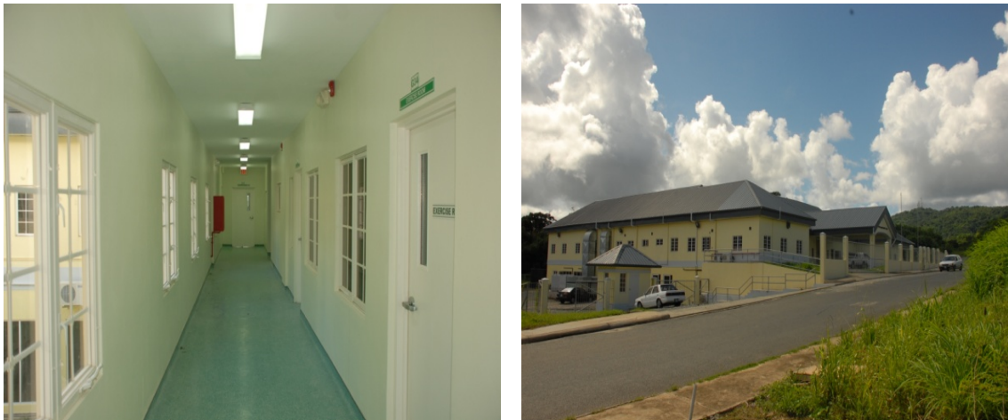
Scarborough Health Centre

42. The HIV/AIDS and Substance Abuse Programme utilized the sum of $3 million for the continuation of treatment, counseling and testing services, and for creating AIDS awareness on the island. A total of twenty-three (23) representatives of village councils and NGOs, including persons living with HIV/AIDS, received specialized skills training in monitoring and evaluation.