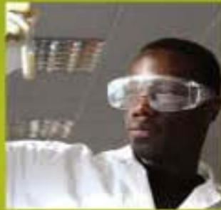
Public Sector Investment Programme Tobago 2011

Government of The Republic of Trinidad & Tobago