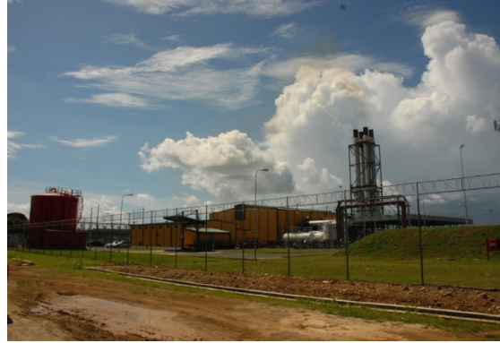
T&TEC Power Plant

23. Other achievements under this area included: