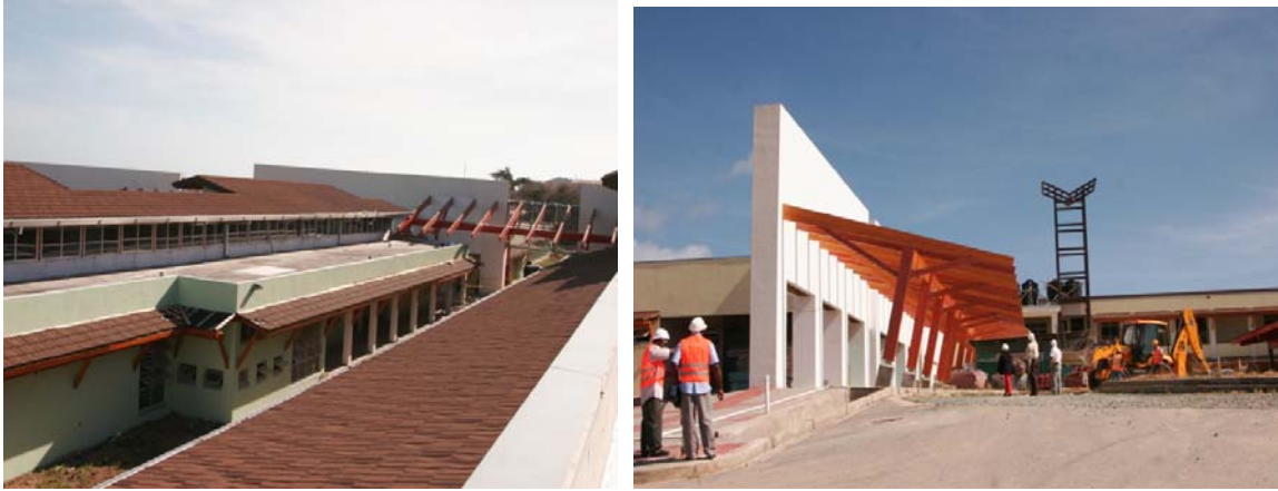
Scarborough General Hospital construction

41. At the Studley Park Integrated Waste Facility, construction of a diesel bund and grease, fats and oil treatment ponds were completed. The cubicles for derelicts, though experiencing delays resulting from heavy rainfall, were 40 percent completed. Construction of the tank stand for the wash bay area was 85 percent completed.