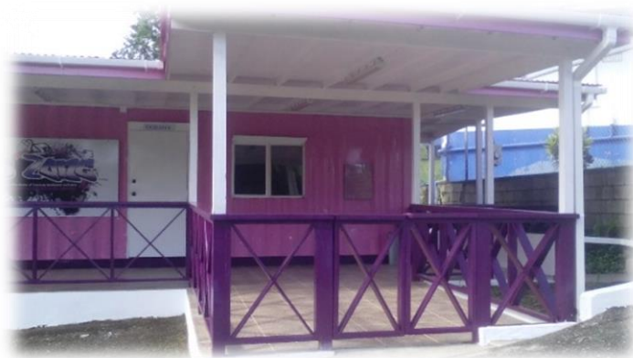
Calder Hall Y- Zone