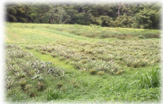
Mixed Crops -Lure Estate