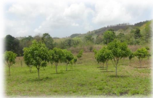
Cherry Trees -Courland Estate

15. In addition, assistance to farmers was given through the in vitro production of crops to aid in the transfer of the new methodologies of plant propagation.