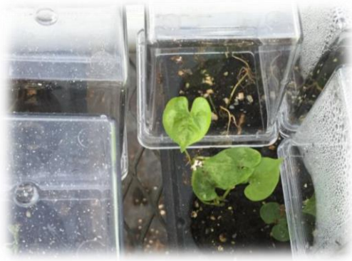
Tissue Culture Plant