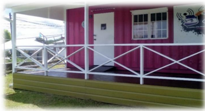
Vocation Centre for Persons with Special Needs

45. Care of the elderly is continually being increased through the Golden Apple Programme where $2.4 million was expended to provide care to one hundred and twenty (120) clients via one hundred (100) caregivers. At the Tobago Elderly Housing and Rehabilitation Centre, the elderly participate in physical activities such as swimming, exercise, sewing, food preparation, gardening and craft. Approximately one hundred and thirty-four (134) individuals are registered at one of four centres.