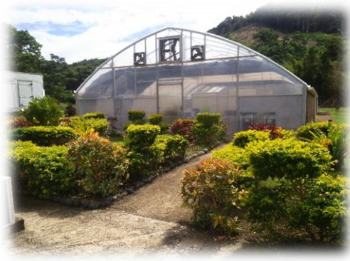
Green House – Tissue Culture Lab

16. The importance of bolstering the island's level of food security is consistently emphasized through the Home Garden Initiative project. Achievements to date are as follows: