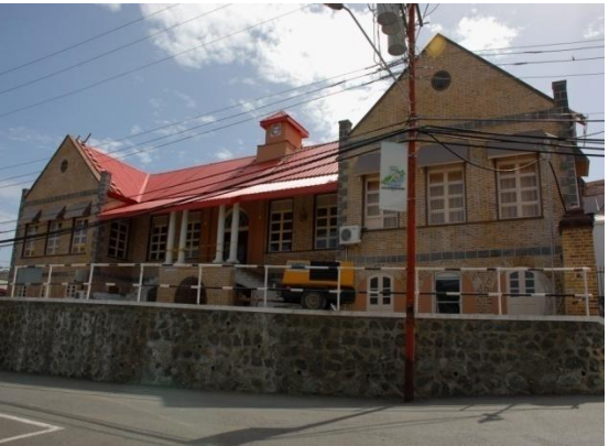
Restoration of the Old Administration Building - Scarborough