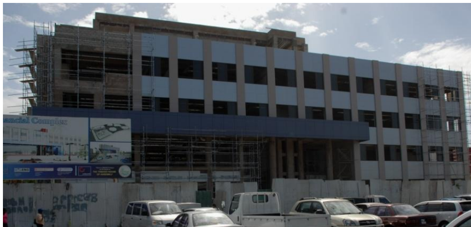
THA Financial Complex under construction