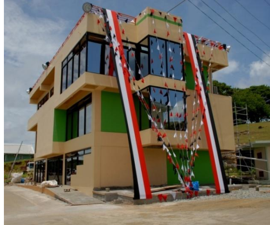
Works Head Office Extension