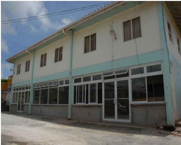
New Licensing Office