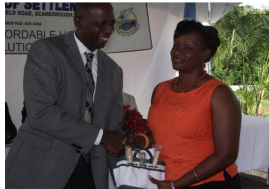
A proud recipient of keys to her new home in Adventure

41. The quality of the housing stock on the island was improved by providing financial assistance from the Home Improvement Grant and Home Improvement Subsidy Programmes for repairs to qualified home owners. For this fiscal year, 351 cheques totaling $2,632,500 were issued to home owners under the Home Improvement Grant Programmes. Additionally, 31 cheques totaling $310,000 were distributed from the Home Improvement Subsidy Programmes.