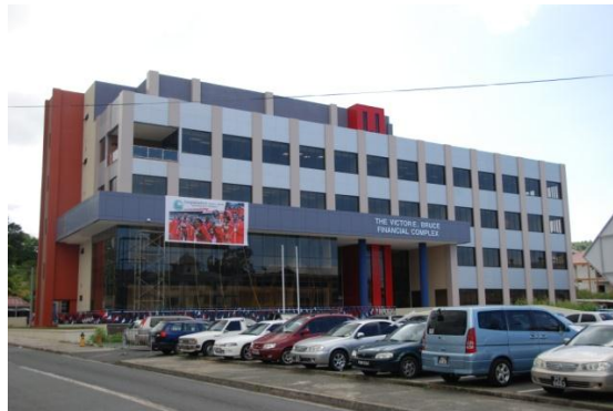
THA Financial Complex was completed and opened in June 2012.

71. The Tobago House of Assembly utilized the sum of $49.8 million for the construction and restoration of public buildings. The THA Financial Complex – renamed the Victor E. Bruce Financial Complex – was completed with just over $4 million being expended in fiscal year 2012.