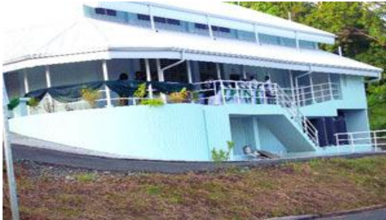
The John Dial Community Centre

Community Centre was completed at a cost of $6.9 million and was officially opened in March, 2012. The facility was outfitted with a computer room, stage, kitchen and meeting space for community activities. The Speyside Multipurpose Community Facility was approximately 65 per cent completed with a scheduled end date of October, 2012. A total of $4.9 million was expended on this Facility.