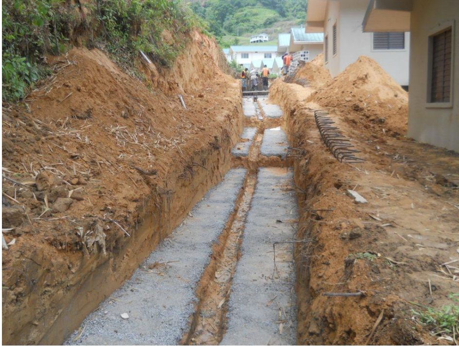
Brace Wall under construction at the Castara site for the THA Housing Programme

68. There were other challenges facing prospective and existing homeowners. As a result, other projects were activated to address these needs. Specifically, over $5.3 million were expended on the Home Improvement Grants, the Home Improvement Subsidy and the New Home Completion Programme. Collectively, these Programmes benefitted 560 Tobago families.