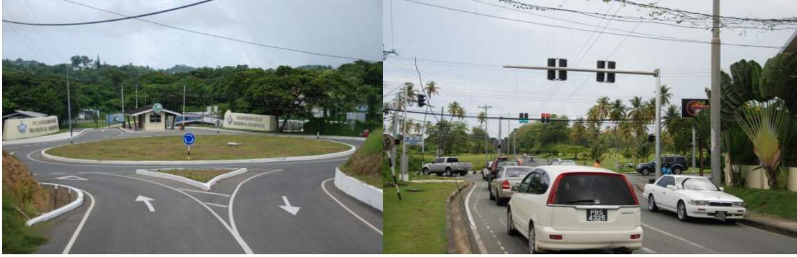
At left; the Roundabout and Sidewalk in Signal Hill and at right; the Buccoo Traffic Lights

42. The Scarborough Enhancement Project is geared to revitalizing and renovating the main town, by addressing urban design, traffic management, informal vending, flood mitigation and beautification. Over $10 million was allocated to these initiatives. Achievements under this Project included: