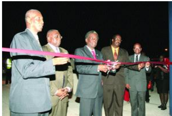
Ribbon Cutting Ceremony – Opening of the Financial Complex –