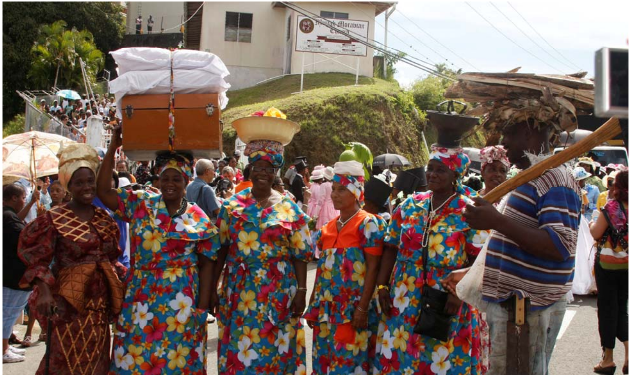
Old Time Wedding

20. The culture and heritage of the island of Tobago is recognized as part of its patrimony, legacy and resource-base as well as a tool for knowledge acquisition and transfer. In addition, it is a vital economic asset to be utilized in the production of intellectual capital in an increasing knowledge-driven world. The sum of $6.9 million was allocated for infrastructural developments in the area of Culture for fiscal year 2009. Among the major projects undertaken were: