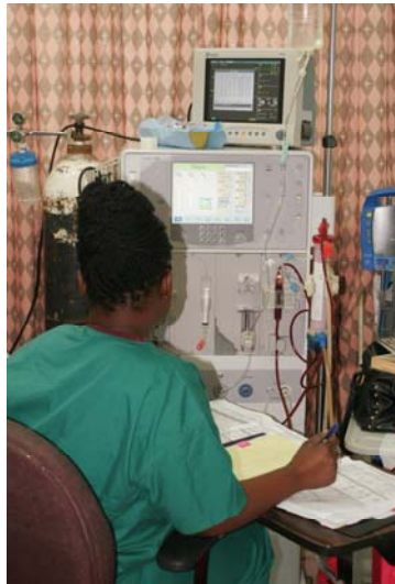
Dialysis in Progress

26. Maintenance and upgrade work at the existing Scarborough Hospital also continued. The Doctors' Common Room was refurbished and renovation of the Oncology Unit was substantially completed. The network infrastructure was upgraded and e-mail services, intranet and system management tools were installed. Medical equipment and machinery were also purchased for the hospital, including an anaesthetic machine at a cost of $0.9 million, as well as a recliner and wheelchairs for the Oncology Unit. Designs were completed for the Psychiatry building, and refurbishment commenced at the Accident and Emergency area .