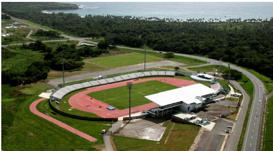
Dwight Yorke Stadium

33. The focus of development, in particular, sustainable development is the economic and social provision for the present generation without compromising the ability of future