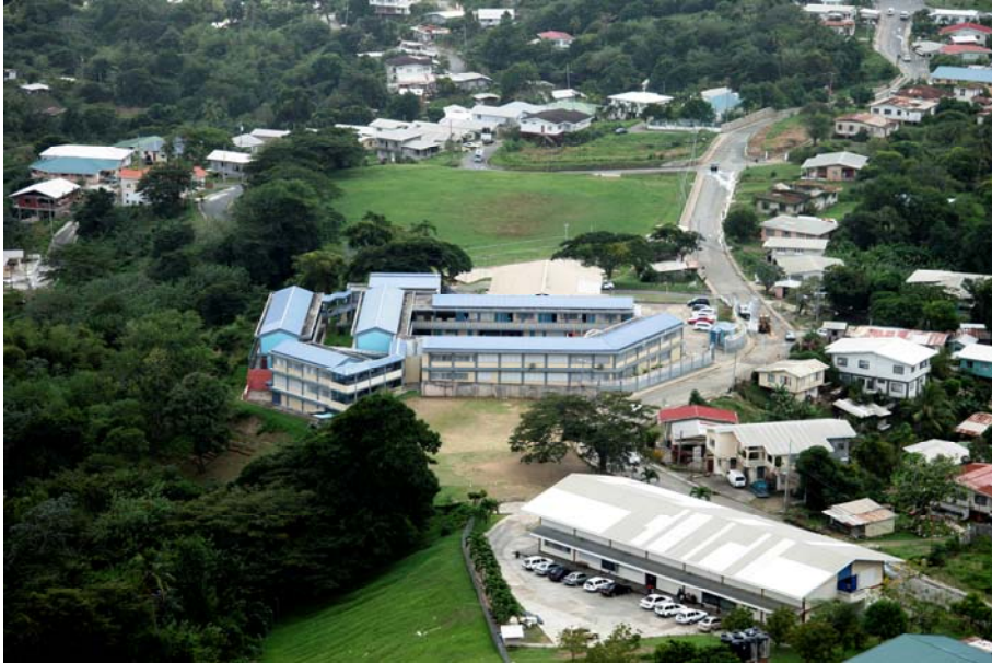
Scarborough Methodist and St. Andrews Schools in Calder Hall

14. In preparation for the establishment of the Education Policy Research Development Unit, $0.3 million was utilized. In addition, $0.1 million was used to establish a Science Research Centre and to develop partnerships with British Gas and NIHERST.