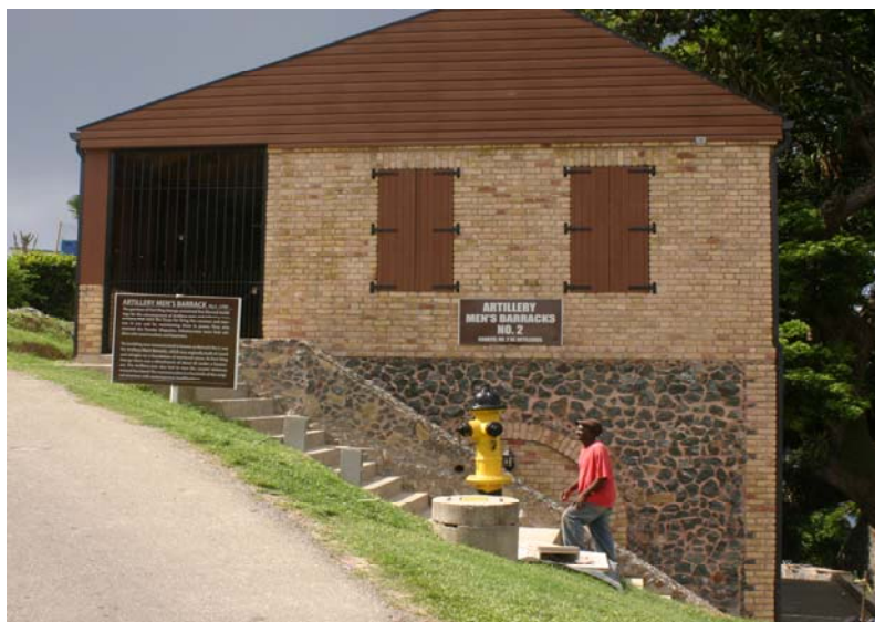
Rebuilt Barracks – Fort King George Heritage Park

52. Tourism continues to be the mainstay of Tobago's economy apart from state involvement in economic activities on the island. Given the current global financial downturn, the tourism industry faces serious survival challenges, as countries compete to attract the dwindling numbers of persons who can afford the luxury of leisure travel today, Tobago must therefore develop the kind of infrastructure and attractive tourism product required to encourage visitors to the island.