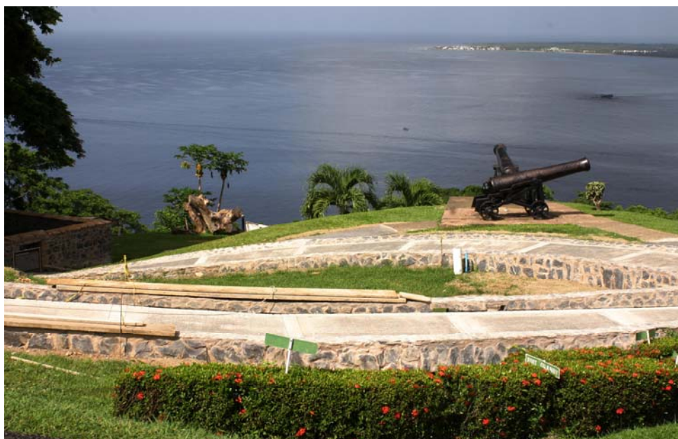
Infrastructure Works – Fort King George Heritage Park