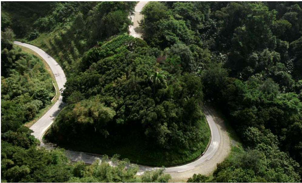
Lanse Fourmi Charlotteville Link Road

62. The sum of $32.8 million was allocated for the management of the roads and bridges programme on the island. Commencement of work on the Milford Road Bridge at Lambeau is a significant development for improving the traffic situation on the south western end of the island. A new bailey bridge was installed in order to dismantle the old dilapidated structure and construct a modern, permanent bridge. Completion of this project will provide a suitable