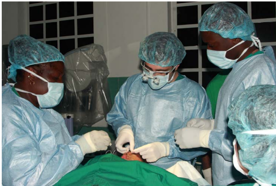
Eye Surgery at Scarborough Regional Hospital

24. Construction also continued on the new Scarborough Health Centre to approximately 60 percent completion overall. Work completed include superstructure, roof members and covering, windows installation, screeding of floors, painting, installation of drains and pipes,