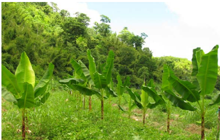
Lure Estate – Tobago

56. A total of $39 million was allocated to the Division of Agriculture, Marine Affairs, Marketing and the Environment to continue the development of agriculture, fisheries and