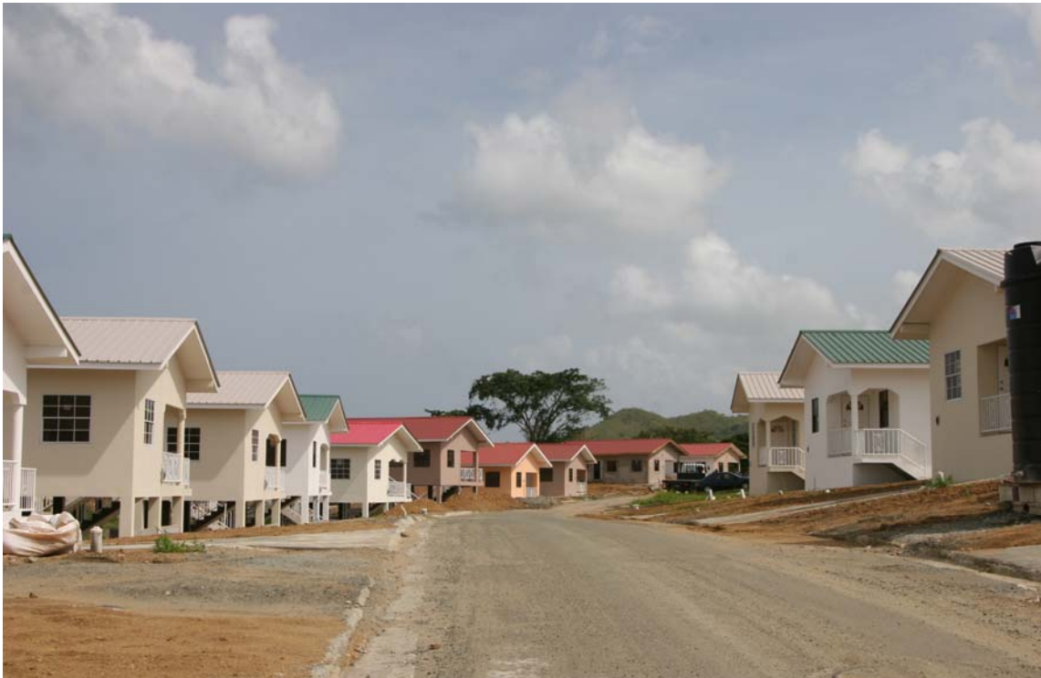
Recently Completed Housing Development in Tobago

31. Approximately $55.5 million was allocated for the continuation of four major housing programmes on the island: Roxborough (renamed Renaissance of Roxborough), Blenheim, Castara and Adventure. The Roxborough Housing Project was completed and work continued at the Blenheim and Castara Housing Developments. The Housing Development