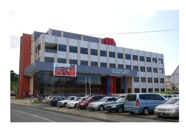
THA Financial Complex was completed and opened in June 2012.

71. The Tobago House of Assembly utilized the sum of $49.8 million for the construction and restoration of public buildings. The THA Financial Complex – renamed the Victor E. Bruce Financial Complex – was completed with just over $4 million being expended in fiscal year 2012.