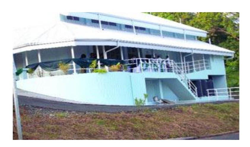
The John Dial Community Centre

Community Centre was completed at a cost of $6.9 million and was officially opened in March, 2012. The facility was outfitted with a computer room, stage, kitchen and meeting space for community activities. The Speyside Multipurpose Community Facility was approximately 65 per cent completed with a scheduled end date of October, 2012. A total of $4.9 million was expended on this Facility.