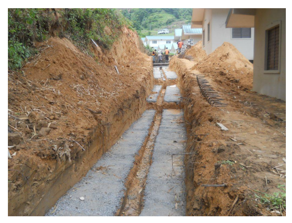
Brace Wall under construction at the Castara site for the THA Housing Programme