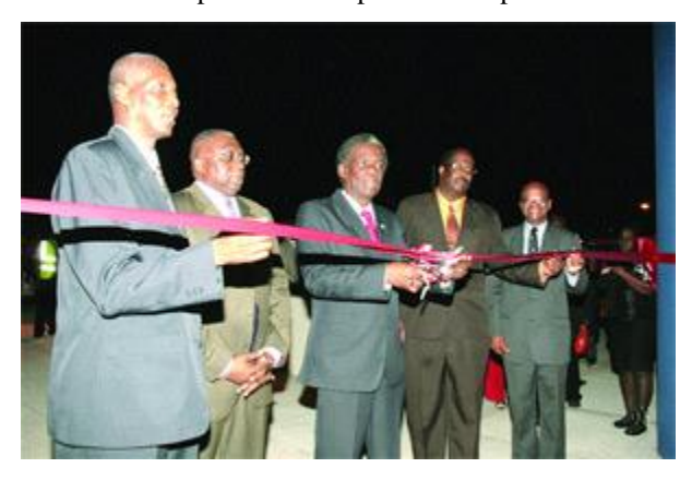
Ribbon Cutting Ceremony – Opening of the Financial Complex – Photo Courtesy Tobago News