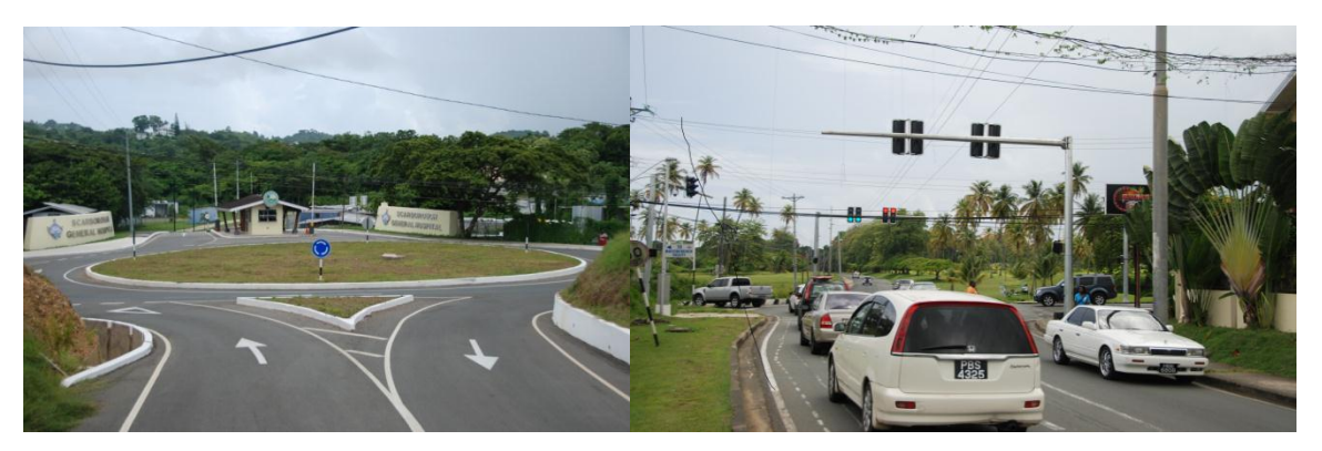
At left; the Roundabout and Sidewalk in Signal Hill and at right; the Buccoo Traffic Lights