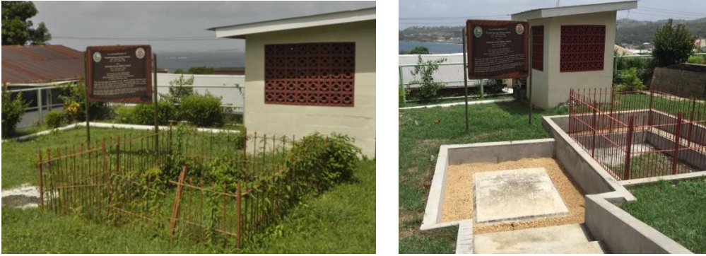
Grave Site Restoration Project

34. The beaches around Tobago also play a major role in the visitor experience and as such is a key component of the tourism product. Speyside Beach Facility was upgraded through a complete overhaul of the entire Beach Facility at a cost of $0.9 million. Simultaneously, informational and historical signs were erected at these and other locations such as the Speyside Water Wheel through the Island Wide Signage Project at a cost of $0.02 million.