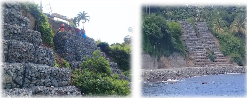
Sea Defense Stabilisation Project

26. A major sea defense stabilisation project on the seaward side of the Windward Road at 'Hanging Down' Roxborough was completed at an overall cost of $10.4 million.