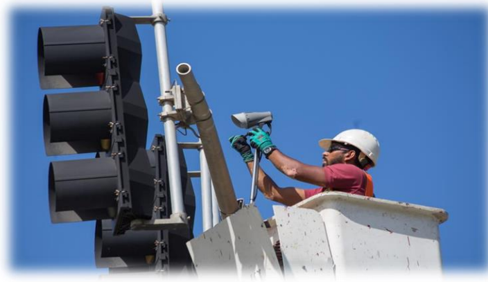
Traffic Light Synchronisation Project

25. The Programme for the Upgrade of Road Efficiency (PURE) completed a Safe School Pedestrian Crossing Zone Review for fiscal 2018. Over 60 speed humps were installed within eight (8) school districts. A contract was awarded for the synchronisation of the traffic lights along the Claude Noel Highway and work on the Phase I has commenced.