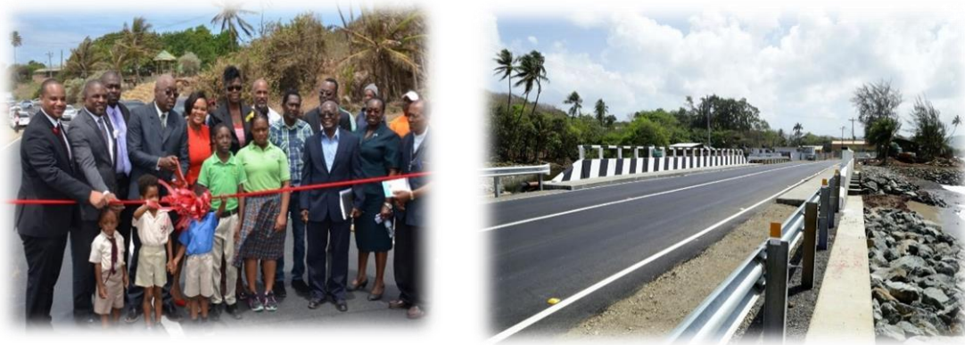
Completed Bridge at Milford Road

22. Reconstruction of the Lambeau River Bridge was completed at a cost of $14 million. The bridge was formally opened on June 4, 2018 and accommodates 2-lane vehicular traffic with sidewalks for the usage and safety of pedestrians. Designs for the reconstruction of two (2) bridges on the Milford Road have been completed.