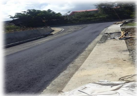
Milford By-pass to Smithfield Road