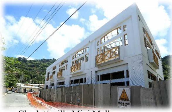
Charlotteville Mini Mall

30. Other projects which are ongoing under the Public Buildings Programme are the Charlotteville and Plymouth/Adventure mini malls which are 83 percent and 75 percent completed, respectively.