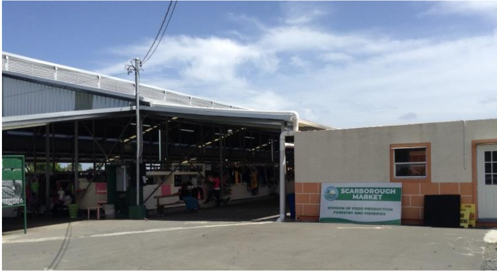
Entrance to the Relocated Scarborough Market

19. The THA continued to develop appropriate policies and procedures for the Marine Resources and Fisheries sub sector, for the preservation of marine life while educating citizens on the benefits of protecting the marine resources.