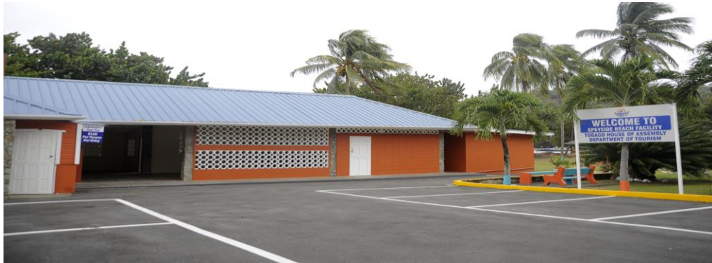
Upgrades at Speyside Beach Facility

34. The beaches around Tobago also play a major role in the visitor experience and as such is a key component of the tourism product. Speyside Beach Facility was upgraded through a complete overhaul of the entire Beach Facility at a cost of $0.9 million. Simultaneously, informational and historical signs were erected at these and other locations such as the Speyside Water Wheel through the Island Wide Signage Project at a cost of $0.02 million.