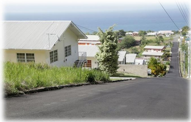
Blenheim Housing Development