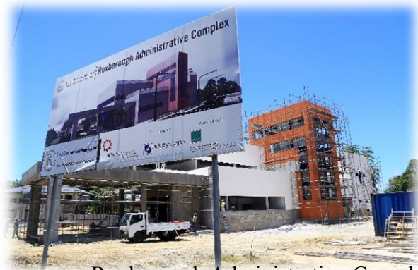
Roxborough Administration Complex

31. In addition, the contract was awarded and work has been initiated at the Calder Hall Administrative Complex for its expansion. The work includes the projection of a new wing to increase the workspace to better accommodate the offices and functions currently undertaken by the Office of the Chief Secretary.