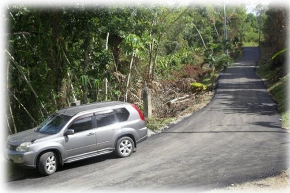
Greenfield Trace, Mason Hall

24. Under this programme, three (3) major projects were completed: construction of sidewalk at John Dial (Phase I and II), construction of large retaining wall at Delaford (near cemetery) and construction of retaining wall as part of the road alignment project at Charlotteville.