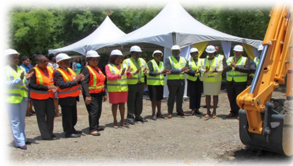
Fig. 37 Sod Turning Ceremony for the New Moriah Health Centre