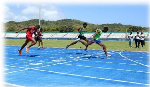
Fig. 32 Athletes in action – Tobago Secondary School Track Championships

60. Similar to primary schools, secondary schools in Tobago were also constantly engaged in sporting meets and competitions. Sporting associations coordinated the schools' participation in the sport events and the Division subsidised costs associated with purchasing uniforms and equipment for students. The Division also provided equipment and supplies for local sporting events, hosted by the associations.