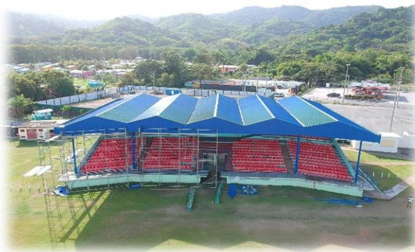
Fig. 34 Roxborough Pavilion

69. The environmental conditions associated with the location of the Roxborough Pavilion led to the degradation of the facility over the years and the need for repair. The repair works were phased in order to efficiently address issues with the facility. Phase one entailed repairs to the trussing, columns and rails at a cost of $1.1 million, as well as inspection services to ensure that welding was done properly – at a cost of $0.1 million. The second phase entailed replacement of purlins and roof sheeting and was executed at a cost of $0.7. Phase three works are ongoing and includes electrical repairs.