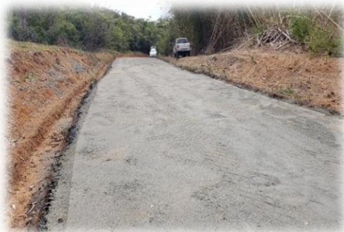
Fig. 3 Goodwood to Mt. St George