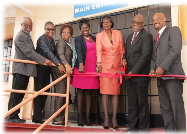
Fig. 41 Commissioning Ceremony - Stroke and Diabetes Centre

80. In 2019, upgrading works were executed at the Stroke and Diabetes Centre, which entailed the installation of sinks, water pump and other plumbing works, replacement of external lighting fixtures, installation of a mirror and equipment for therapy. These works were completed on at a cost of approximately $0.3 million.