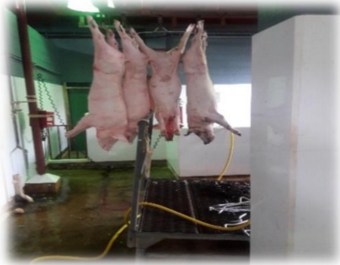
Fig. 9 Scarborough Abattoir