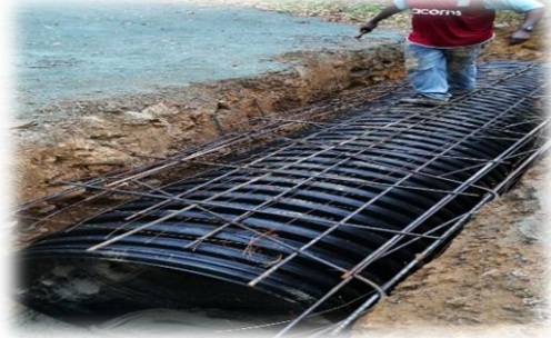
Fig. 8 Cradley Trace access road