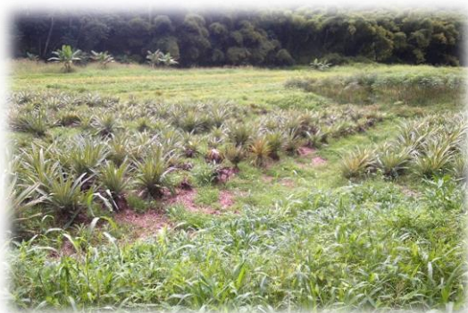
Fig. 1 Cassava and Pineapple - Lure Estate