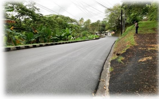
Fig. 16 Windward Road, Argyle