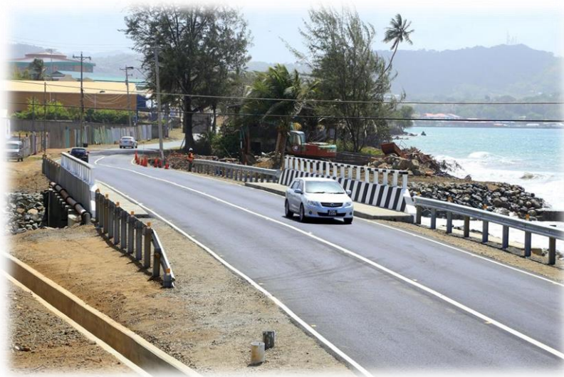
Hii '65' Recently Constructed Road Network

99. The sum of $4.0 million will be used for the upgrade of Claude Noel Highway between the Rockley Vale intersection to Bacolet. An allocation of $2.0 million will be provided for the continuation of upgrades to Milford Road, from the Environment Department, Shaw Park to the Orange Hill intersection. Funds totalling $2.0 million will be allocated for the completion of the Thompson River Bridge and the commencement of works on the Signal Hill River Bridge.