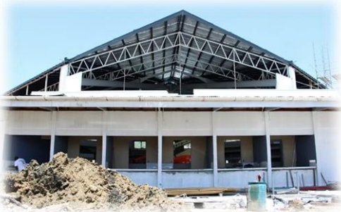
Fig. 11 Scarborough Market Project