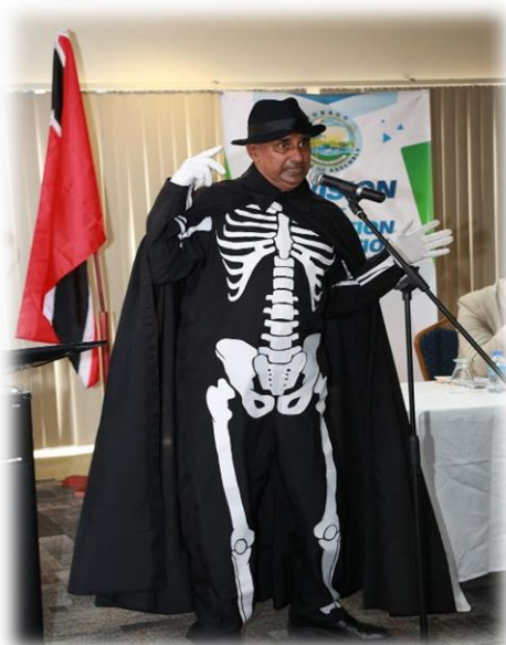
Fig. 28 Performance by Artist at School Arts Festival