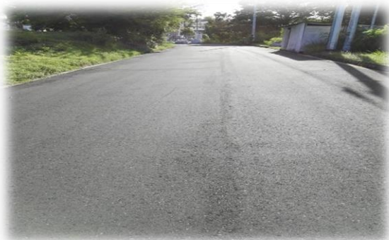
Fig. 17 Goldfinch, Sou Sou Lands