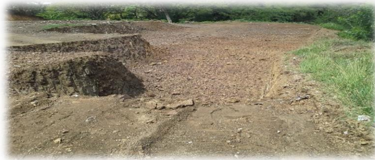
Fig. 39 Excavation Works for the Establishment of the Engineering Cell Project at the Studley Park Waste Integrated Facility

77. The Studley Park Waste Integrated Facility Engineering Cell Project is being conducted in-house by the Public Health Department and entails the construction and fencing of a new Solid Waste Engineering Cell. Expenditure of $0.2 million was realised.