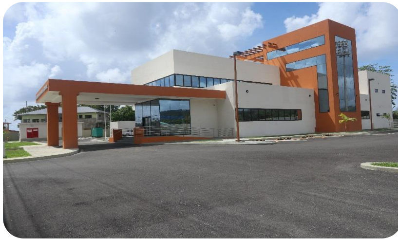
Fig. 42 Roxborough Administrative Complex

81. Work on the construction of the new Roxborough Administrative Complex, which provides essential governmental services to the people of windward, Tobago, was completed in May 2019.