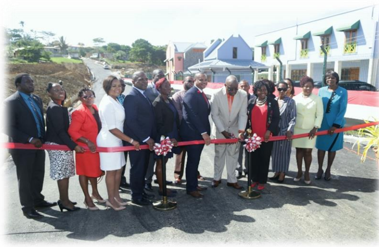
Fig. 23 Opening of Phase, I – Milford road bypass to Smithfield

Work on Smithfield between Smithfield Trace and Smithfield, Connector (Phase 1a) is ongoing and the project is 90 percent completed.