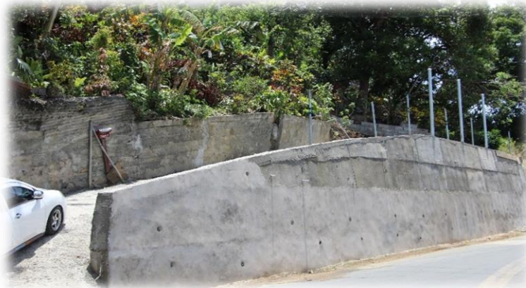
Fig. 22 Mt. St. George Retaining Wall

29. In an effort to deal with the difficulties of traffic congestion and parking, due to increased traffic, the THA commissioned a three-month traffic and parking study. The study focused on issues such as vehicular congestion, number of drivers on the roadway and types of vehicles, in particular areas and peak traffic periods. The study was completed in April 2019, at an approximate cost of $1.0 million, and the results of the survey will provide a basis for project development and implementation of a suite of initiatives to address the efficiency of the movement of traffic particularly in and out of Scarborough.