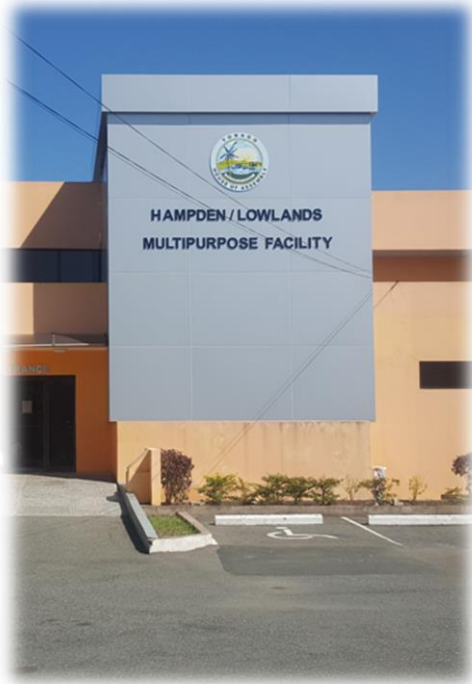
Fig. 36 Hampden/Lowlands Multipurpose Facility