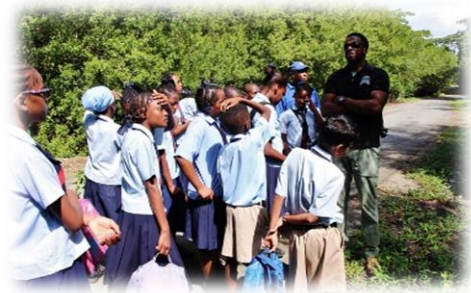
Fig. 13 Schools education symposiums -Gibson Jetty