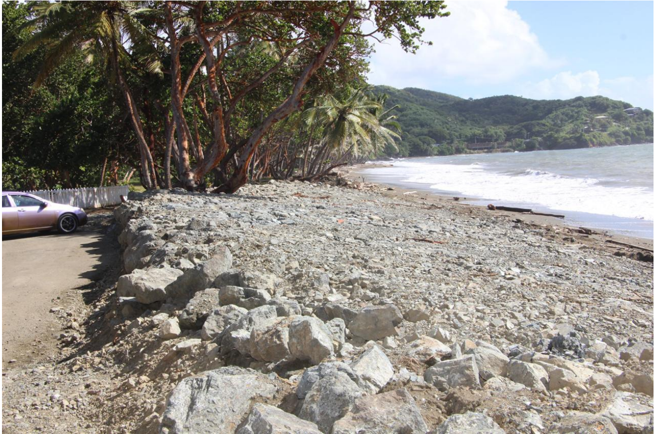
Hi '66' Coastal Protection