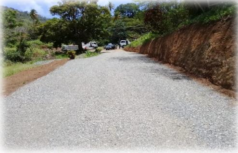
Fig. 7 Mt. St. George to Mason Hall access road