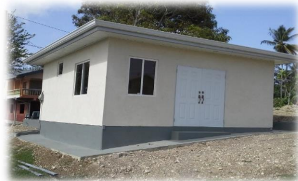
Fig. 38 Newly constructed toilet facility and office space at the Plymouth Cemetery

75. Phase 1 of the Plymouth Cemetery Upgrade Project entailed the construction of a toilet facility, inclusive of an office space and tool room at the Plymouth Cemetery. This project was completed on March 12, 2019, at a cost of approximately $0.5 million.