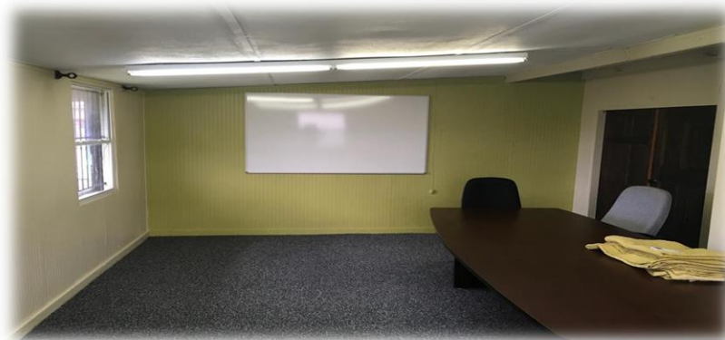
Fig. 40 Newly carpeted conference room at the Mediation Centre

78. The Mediation Centre Upgrade Project involved the re-carpeting, re-painting of the conference room and the installation of an air-conditioning unit at the Centre. These works were completed at a cost of approximately $0.3 million.