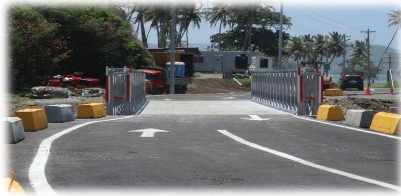
Fig. 24 Temporary Bailey Bridge at Thompson River