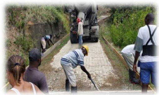
Fig. 5 & 6 Macnab Bay Road - Goodwood