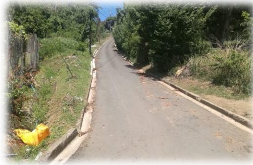
Fig. 18 Pleasant Prospect Trace