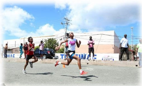
Fig. 30 Athletes in action at Tobago Zone 3k finals

54. Primary schools in Tobago were continuously engaged in sporting meets and competitions. Funding was provided for purchasing uniforms and equipment for students, as well as equipment and supplies for local sporting events, and travel to Trinidad for national competitions in disciplines such as athletics, football, netball and cricket.