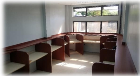
Fig. 35 Bethesda Multipurpose Facility

71. In 2019, the Belle Garden Multipurpose Facility was completed and funds totalling of $0.7 million were expended. Upgrading works were also conducted on the Bethesda Multipurpose Facility (Fig. 35) and included replacement of the air-condition units in the main hall, office and the workshop room.