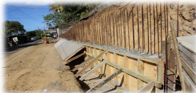
Fig. 21 Construction work at Mt. St. George Retaining Wall

28. The windward areas of Tobago are volcanic and hilly with undulating and winding roads. As such, the maintenance schedule requirements for these areas are higher due to unstable geology, prevalence of landslides, slippages and the effects of hillside runoff. The following projects were executed under the Windward Road Special Development Programme : the construction of two retaining walls in Mt. St. George (with dimensions of 130ft in length by 6ft height and 127ft in length by 8ft height) was completed.