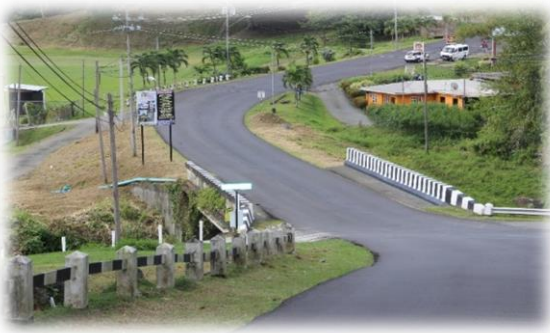
Fig. 15 Windward Road, Richmond