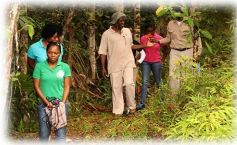
Fig. 14 Forest trail tour - Main Ridge