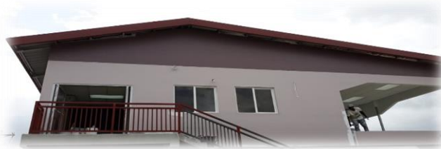
Fig. 33 Shaw Park Sport Administrative Building

68. The THA conducted work on the refurbishment of the Shaw Park Sport Administrative Building, to ensure the safety and comfort of the staff, athletes and patrons of the facility. Works on the first phase are nearing completion and head personnel in the Sport Department of the Division will be housed at the location. The overall cost of the project is was $1.1 million.