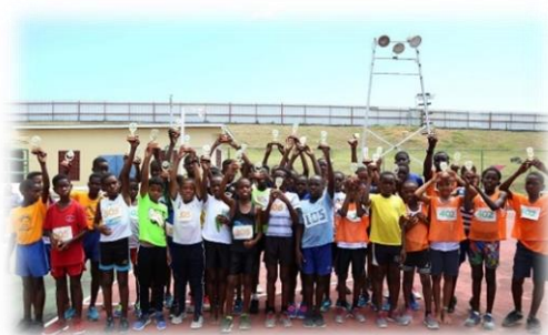
Fig. 31 Participants at the Tobago Zone 3k finals