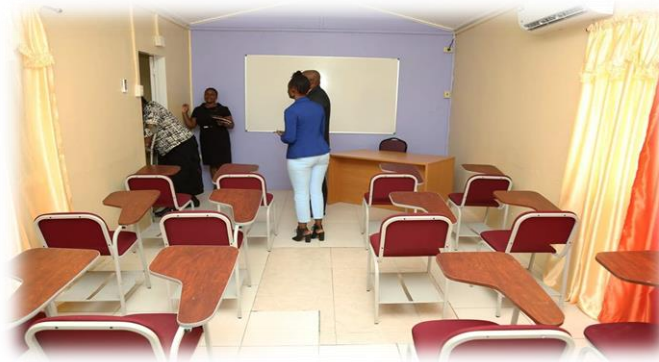
Fig. 27 Classroom at the Tobago Teachers' Centre

45. The Division established the Tobago Teachers' Centre (TTC) at Mardon House in John Dial, in 2018, which provides support to teachers to enhance the delivery of the curriculum. In particular, the TTC serves as an educational hub to stimulate and encourage new approaches to teaching and learning, among teachers in Tobago.