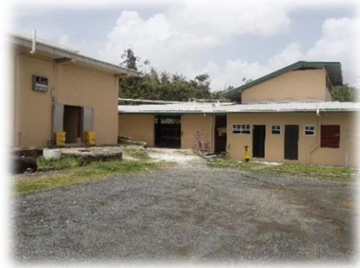
Fig. 10 Scarborough Abattoir