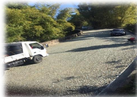
Fig. 4 King's Bay to Waterfall access road