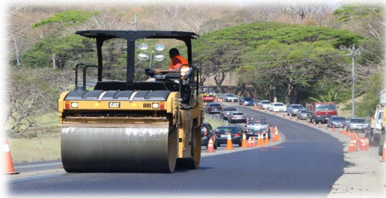
Fig. 20 First layer paving of the Claude Noel Highway