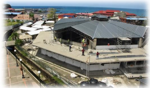
Fig. 12 Scarborough Market Rehabilitation Project

22. The Department of Forestry continued the protection, preservation and enhancement of Tobago's environment, along with the sustainable management of the island's air, land and water resources. Highlights included: