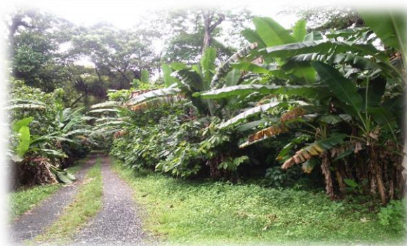
Fig. 2 Banana and Cocoa – Lure Estate