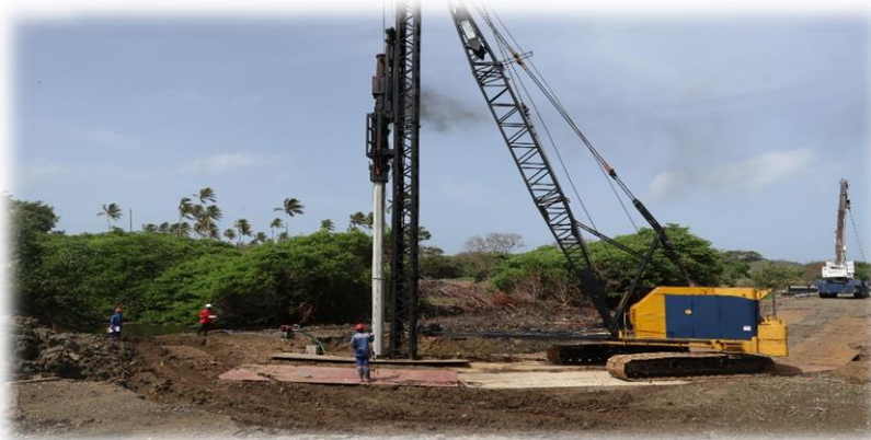
Fig. 25 Piling work in progress at the Thompson River Bridge