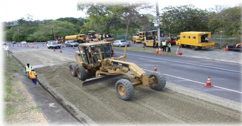
Fig. 19 Extensive Rehabilitation of the Claude Noel Highway