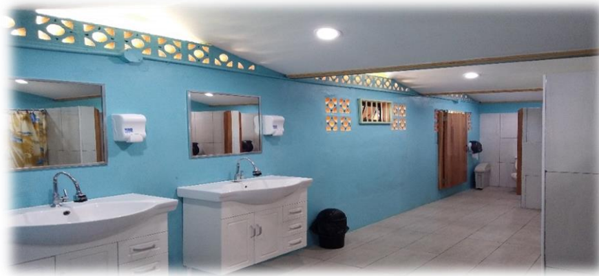
Fig. 26 Refurbished Washroom Areas at Mt. Irvine Beach Facility

33. Extensive repairs were conducted on the washrooms of the Mt. Irvine Beach Facility. The scope included an overhaul of the plumbing and electrical services in both washrooms inclusive of installation of new fixtures and fittings. The concession spaces at the ground and first floors were also renovated, and included replacement of floor and wall tiling, electrical wiring and refurbishment of the ceiling and repainting. Expenditure at midterm was $0.4 million.