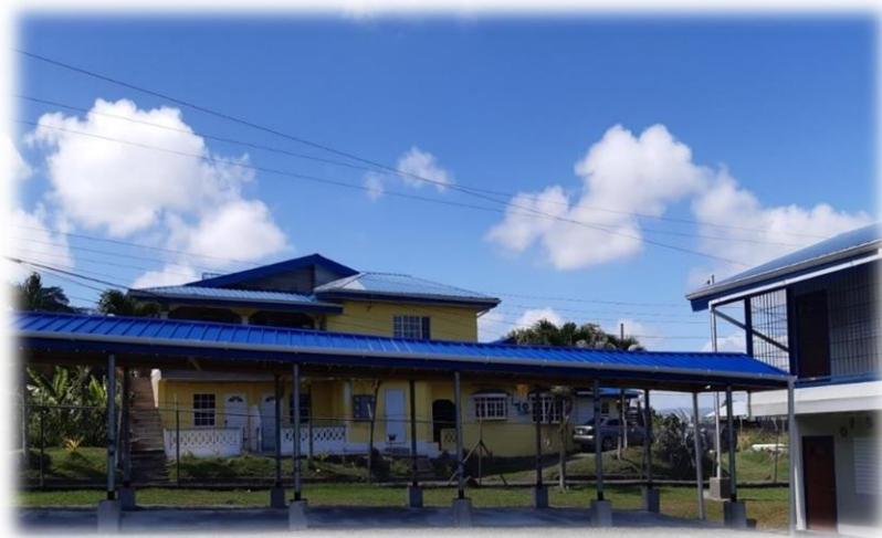
Figure 31: Construction of Covered Walkway at Patience Hill Government School