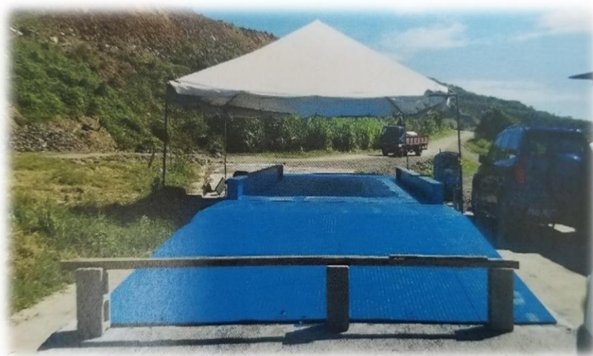
Figure 51: Relocated Weighbridge