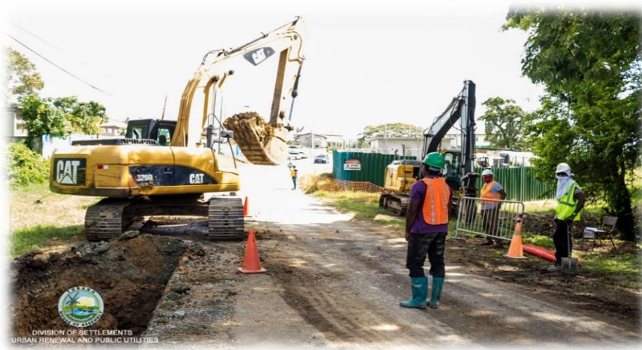
Figure 41: Pipe laying for the Sewer Tie-In at Signal Hill

61. The THA has undertaken a waste-water integration sewer tie-in project at the Signal Hill Housing Estate in order to link the Signal Hill Development with the waste water treatment plant at Scarborough. UDeCOTT is the project manager for this initiative. The project is in progress and is expected to be completed in August 2020, at an overall cost of $4 million. In fiscal 2020, an allocation of $2 million was given for the project and these funds were expended.