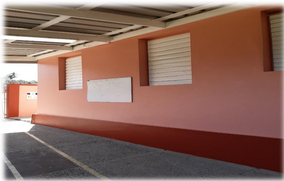
Figure 29: Painting Work at Lambeau Government Primary School