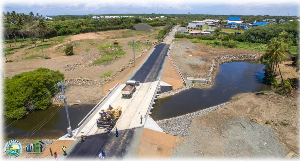
Figure: 18 Thompson River Bridge

as an alternative access to the Claude Noel Highway, thereby decreasing traffic congestion and improving the time taken by motorists to and from Scarborough.