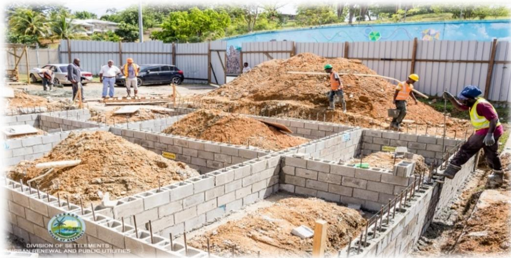
Figure 46: Public Convenience at Scarborough – Construction in Progress

67. The second public convenience facility is under construction in Scarborough in the vicinity of the Scarborough Library. The expected cost of this facility is approximately $1 million and funds expended in fiscal 2020 amounted to $0.5 million.