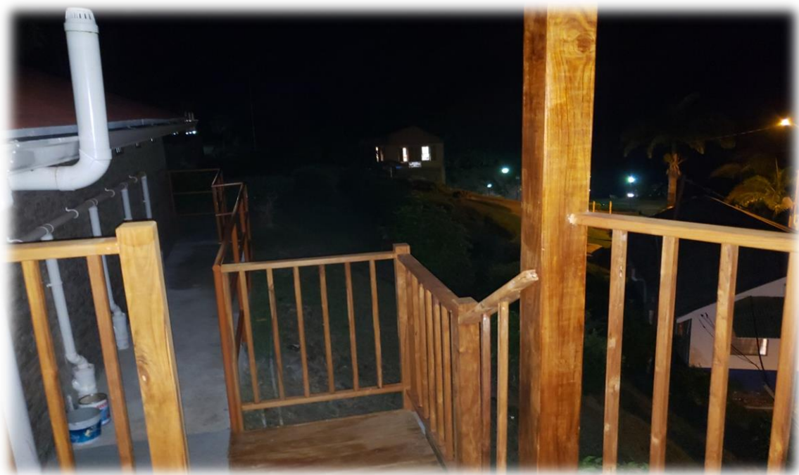
Figure 23: Work at Icons of Tobago Museum

31. Fort King George Heritage Park is one of the best preserved colonial forts in Tobago. The Park offers its visitors artefacts, military relics and documents from the colonial period which have been preserved in the museums. The THA has been continuously engaged in restorative work at the Park. During the financial year 2020, a roof was constructed over the patio deck at the Icons Museum. Other project activities included railing works and floor treatment sanding and staining. The project commenced in December 2019, and was completed in January 2020, at a cost of $0.2 million.