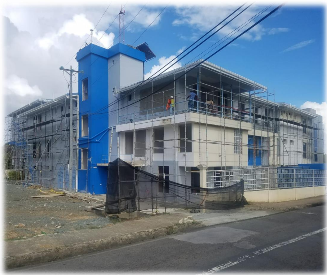
Figure 56: External painting works have commenced; window framing works have also commenced; metal works to railing is ongoing

85. In fiscal 2020, a total of $14.4 million was expended on the Calder Hall Administrative Complex Expansion. This is one of four priority projects under the Office of the Chief Secretary. The project is approximately 85 percent completed with the structure for the first floor, second floor and roof for both the west and east wing having been completed. Substructure works and block works for the relocated homework center were also completed in addition to ceiling framing works. HVAC installation works for the homework centre have commenced.