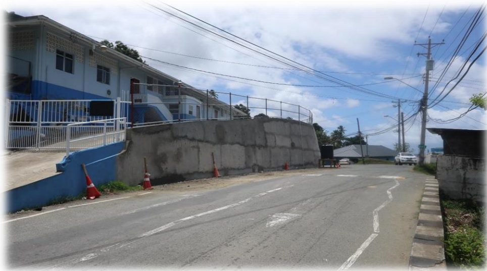
Figure: 17 Retaining Wall at Pembroke Anglican School