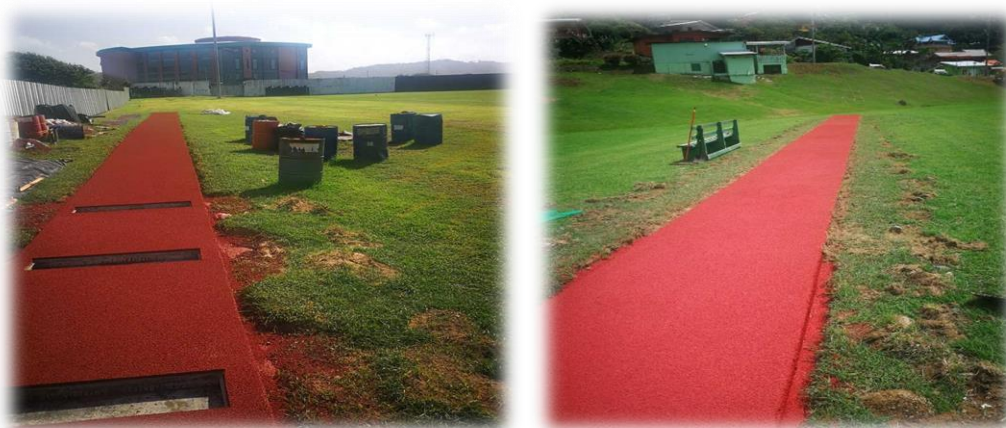
Figure 40: Newly installed granules at the Speyside Facility

55. This project entailed the installation of granules to the newly constructed long jump pits at Speyside and Shaw Park Facilities. This was completed in July 2020 at a total cost of $0.3 million.