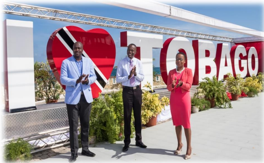
Figure 44: The “I ♥ Tobago” Sign being Commissioned

65. The sign’s location allows for maximum visibility to locals and tourists arriving via the Inter-Island Ferry Service and provides an ideal location for photo opportunities. The sign was constructed by a local contractor at a cost of $0.9 million. Park benches have been installed in the area and the Division has purchased the lights and other items necessary to illuminate the sign and the contract to install the lighting has been awarded. The area will be created into an appealing park area. The project received a revised allocation of approximately $0.3 million and further expenditure in the sum of $0.2 million was incurred in fiscal 2020.