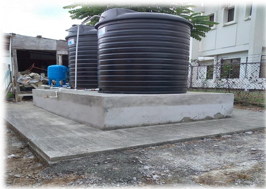
Figure 26: Tank Farm constructed at Bacolet Dance Studio

33. The Bacolet Dance Studio was renovated in August 2019, to address an issue with the supply of pipe-borne water at the Facility. The THA constructed a tank farm to ensure that there is a constant water supply when the Facility is operational. The scope of works included the construction of the tank stand, procurement of two (1,000 gallon) water tanks and procurement and installation of a water pump.