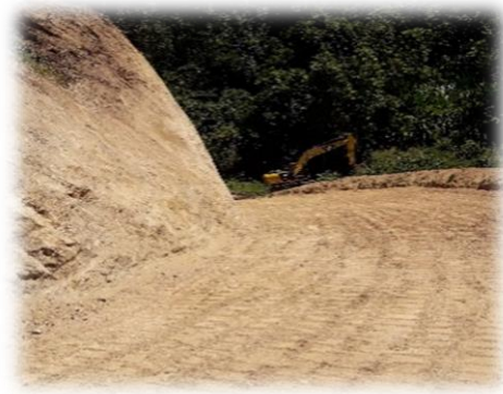
Figure: 13 Widowers to Adelphi