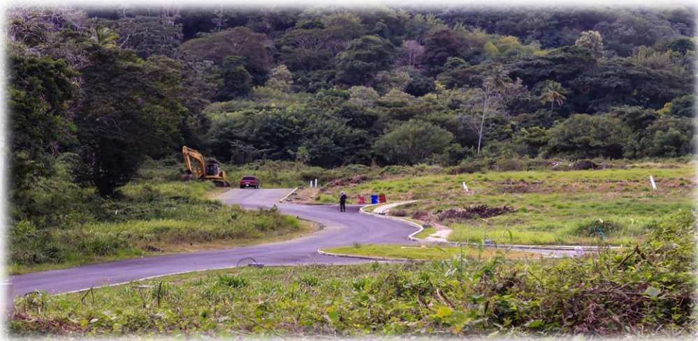
Figure: 43 Courland Estate Land Development