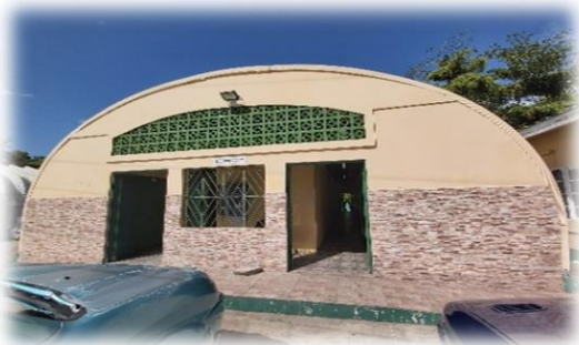
Figure: 4 Pigeon Point Fishing Facility