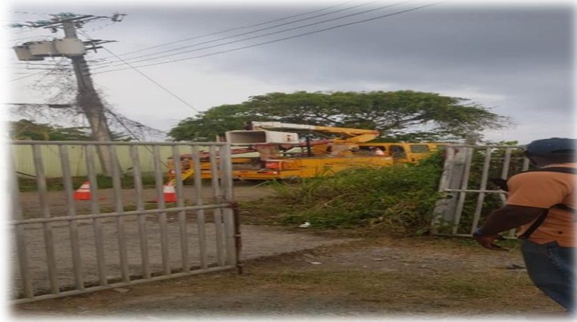
Figure: 32 T&TEC reconnecting electricity at Scarborough Secondary School