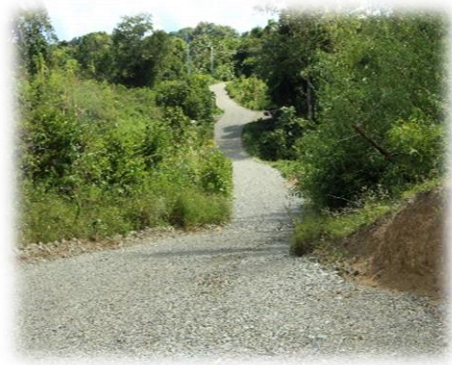
Figure: 11 Adelphi Widowers Lot