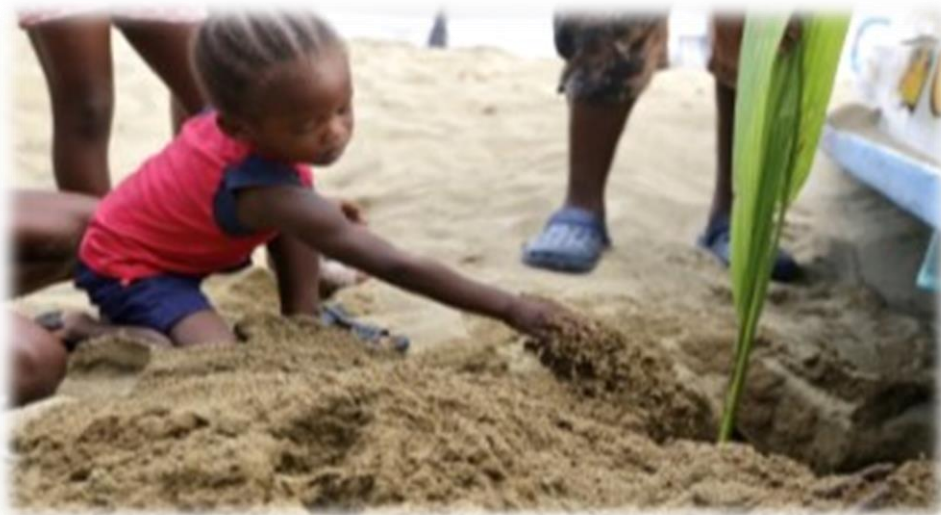
Figure: 15 Tree Planting Exercise in North East, Tobago