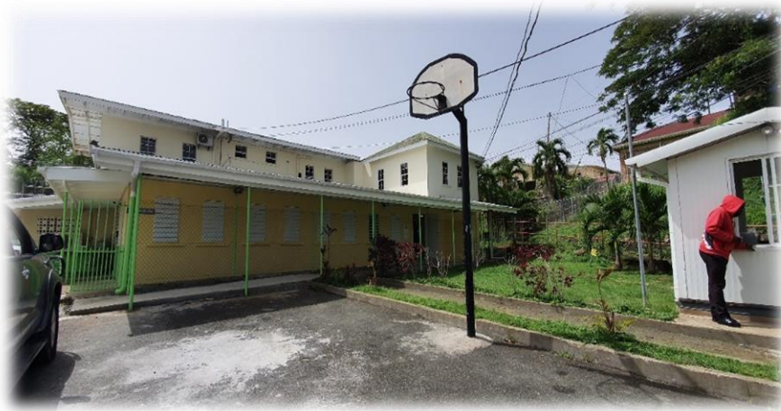
Figure 48: Infectious Disease Facility