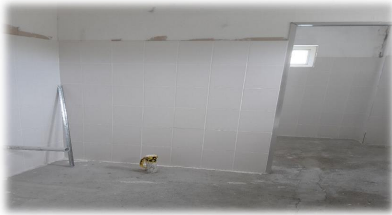
Figure 55: Moriah Health Centre Project (Interior)