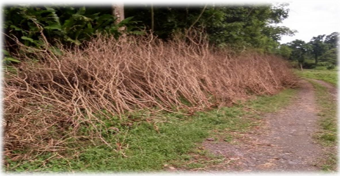
Figure: 8 Cassava sticks for redistribution to farmer