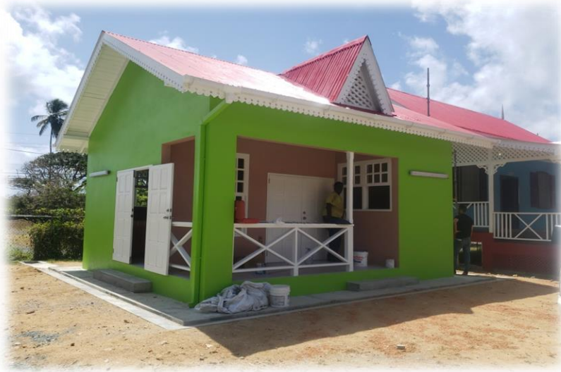
Figure 27: Kitchen Construction at Pembroke Heritage Park

executed. Package I entailed the construction of a 20 ft. x 20 ft. kitchen area at an estimated cost of $0.3 million. The project started in January 2020, and was completed in February 2020.