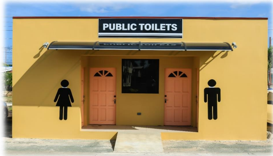
Figure 45: Public Convenience at Milford Court Commercial Plaza

67. The second public convenience facility is under construction in Scarborough in the vicinity of the Scarborough Library. The expected cost of this facility is approximately $1 million and funds expended in fiscal 2020 amounted to $0.5 million.