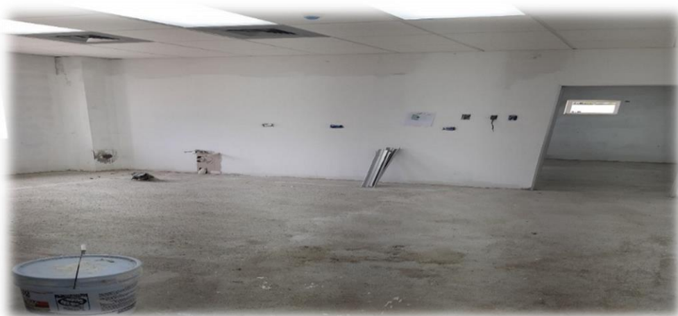
Figure 54: Moriah Health Centre Project (Interior)