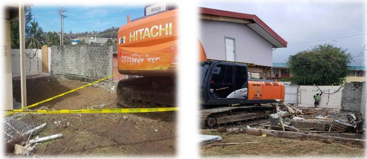
Figure 39: Demolition works at site of New Department of Youth Head Office

48. The Division commenced activities for the construction of an office for the Department of Youth. A site was identified and approved by the Land Management Department for the construction. A dilapidated structure on the site was demolished at an estimated cost of $0.2 million. The Division is in the process of seeking architectural design services for the proposed site.