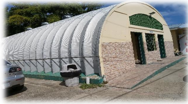
Figure: 3 Pigeon Pt (Storage/Locker rooms)