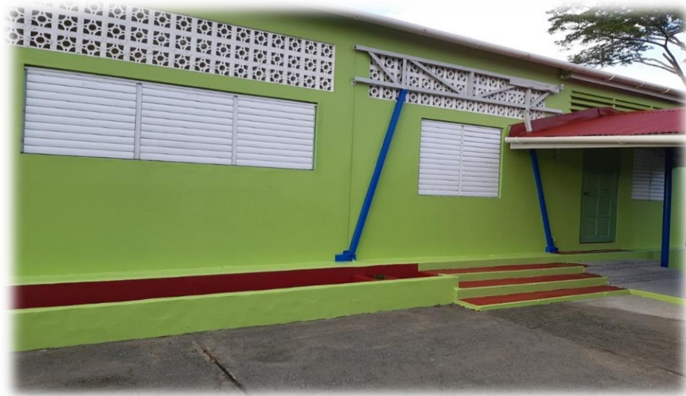
Figure 28: Repainted Bethesda Government Primary School