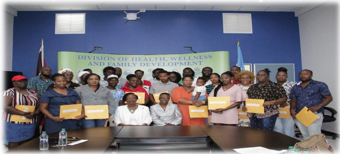
Figure 47: Grants Distribution Ceremony

73. This Programme provides assistance and training to micro-enterprise entrepreneurs, empowering persons to move from vulnerability to self-sufficiency. In fiscal 2020, a total of 55 persons benefitted from the REACH grant. The types of businesses funded included catering, mini marts, linen/ drapes businesses, farming, graphic designs, hair dressing and nail technicians.