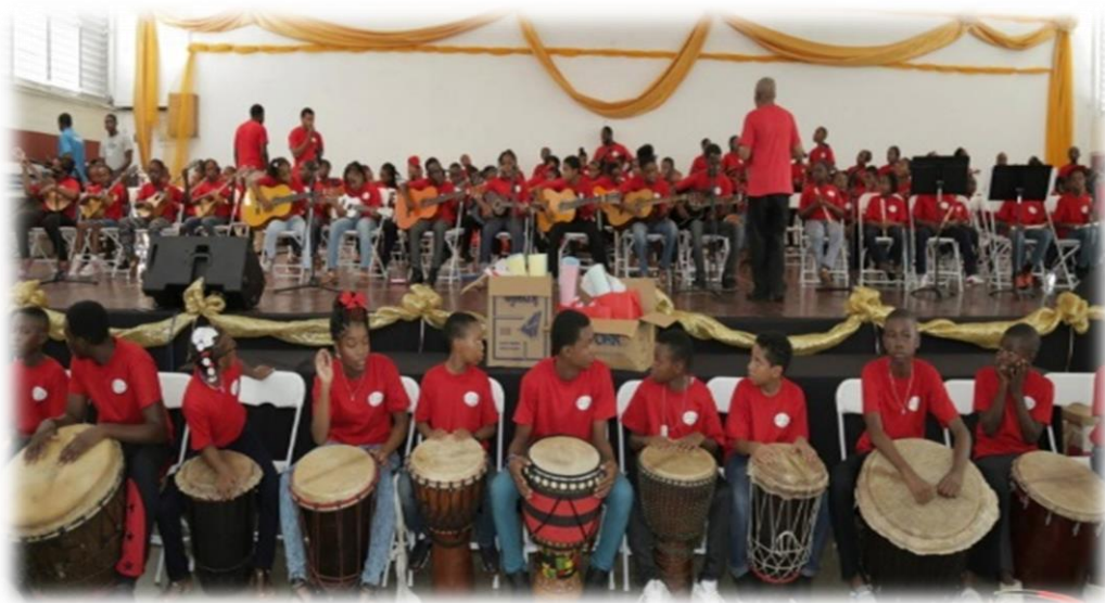
Figure 36: Combined Musical Expression Voice, Drumming and Instrumentals

43. Theatre arts/ drama and dance training was conducted in 22 primary schools in January 2020. A total of 440 children participated and 15 trainers were assigned to instruct in the rudiments of theatre arts/drama and dance. A teachers' workshop was convened with a view to assisting their delivery of the curriculum using the novel medium of theatre arts/drama and dance and 28 teachers also participated.