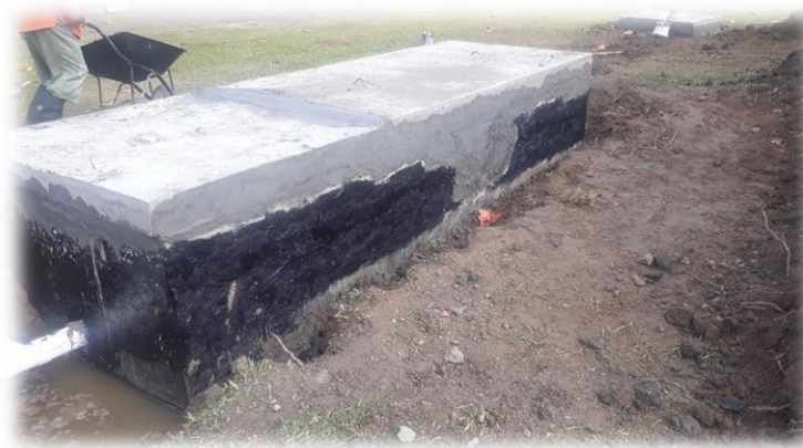
Figure 22: Relocation of Septic System at Speyside Beach Facility

30. The sewer system at the Speyside Beach Facility was affected by water infiltration during periods of high tides. This prevented the effective functioning of the system under normal conditions. As a result of this, it was necessary to relocate the system to alleviate the problem. The project began in January 2020, and was completed according to the specification of the contract and within budget. 90 percent of the contract sum was paid and 10 percent was retained for a period of 12 months (up to January 2021). This system was relocated and has since been performing at optimal levels.