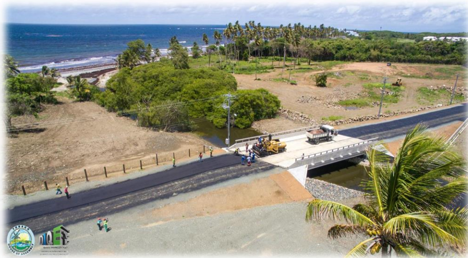
Figure: 19 Thompson River Bridge