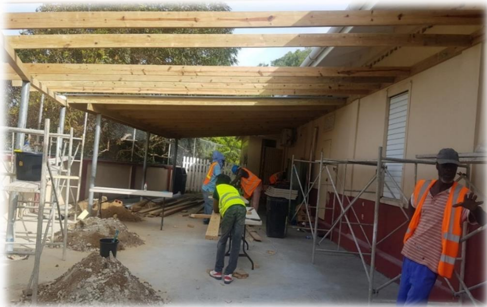
Figure 35: Construction of Awning at Delaford Roman Catholic Primary School