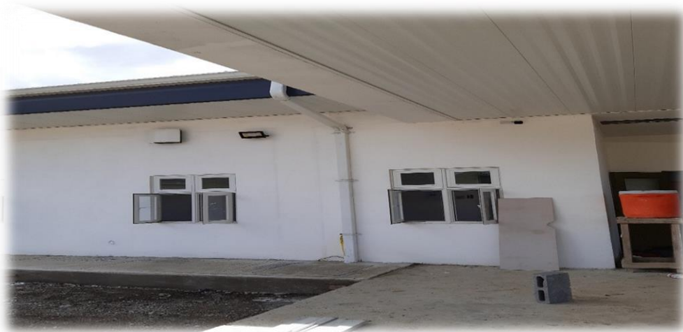
Figure 53: Moriah Health Centre Project (Exterior)