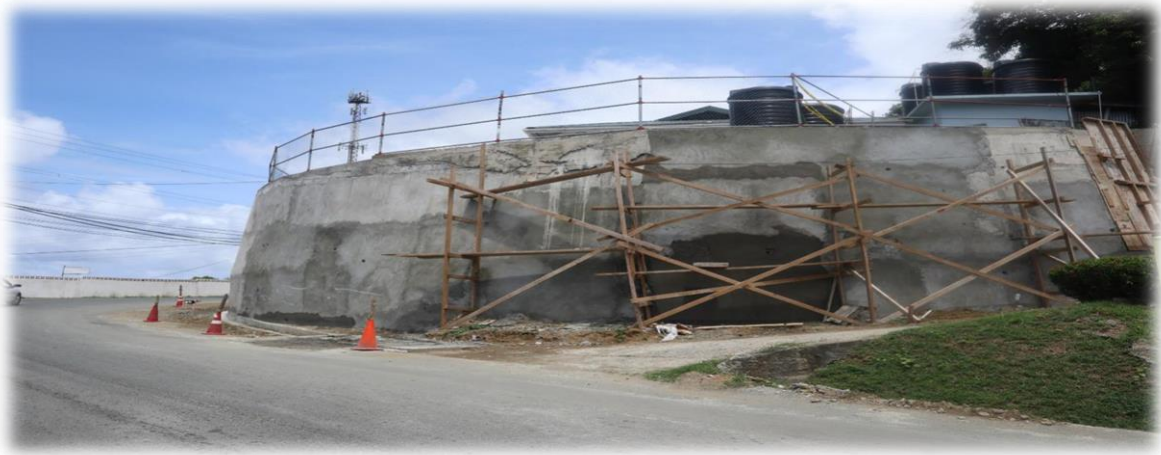
Figure: 16 Retaining Wall at Pembroke Anglican School