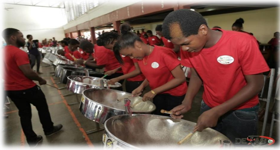
Figure 37: Orchestra in Training Exercises