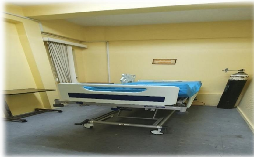
Figure 49: Infectious Disease Facility