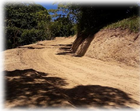
Figure: 12 Widowers to Adelphi