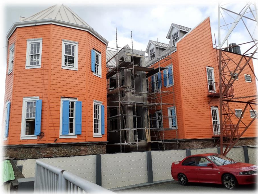
Figure 58: Elevator Shaft under construction

86. The THA conducted upgrading works to the Planning Building which included installation of an elevator, structural stabilisation, roof upgrades, reinstallation of new AC systems, interior and exterior painting and tiling of floors. Renovations were also conducted on the conference room, library and historical basement. The project is approximately 70 percent completed.