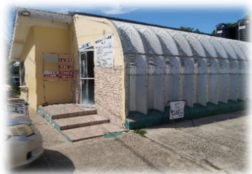
Figure: 2 Pigeon Point (side view)