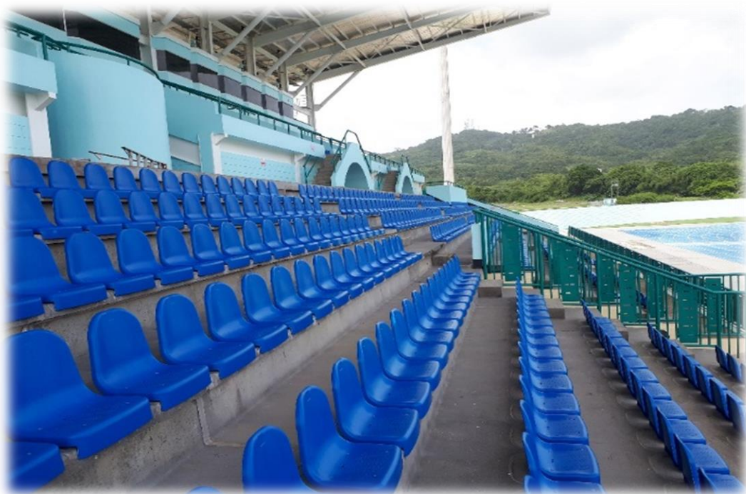
Dwight Yorke Stadium, Tobago