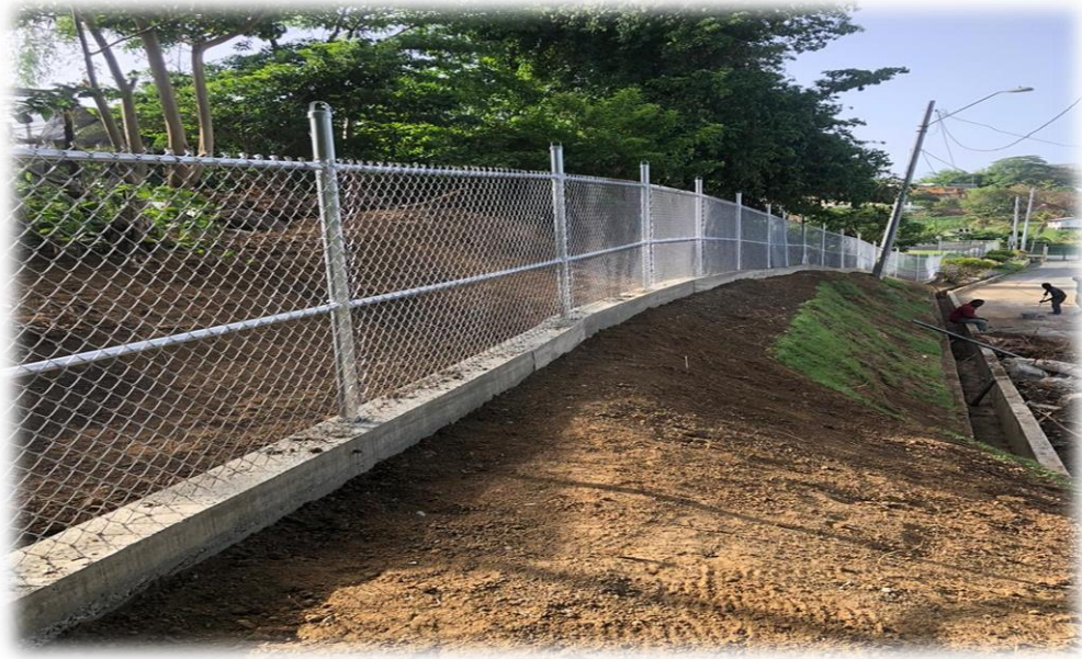
Figure 34: Construction of Fence at Patience Hill Government Primary School