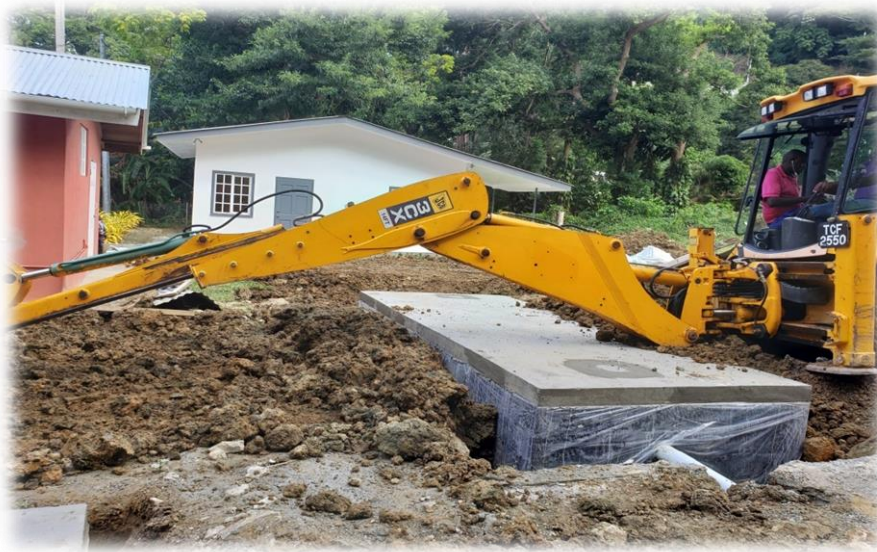
Figure 21: Relocation of Septic System at Charlotteville Beach Facility