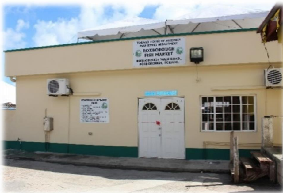
Figure: 7 Roxborough Fishing Facility