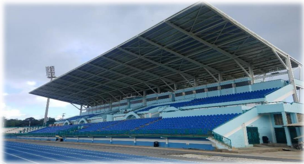
Dwight Yorke Stadium, Tobago

only world class sporting facility which is utilised for various sporting and cultural events. It was constructed in 2000 and is in dire need of refurbishment and upgrading works. Phase III started in fiscal 2020 and will continue in fiscal 2021 with the refurbishment of the gym, rehabilitation of the athletic track, installation of LED lighting and other associated works.