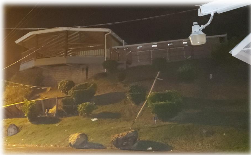
Figure 25: External Work at the Icons of Tobago Museum, Fort King George;

Source: Project Implementation Unit DTCT