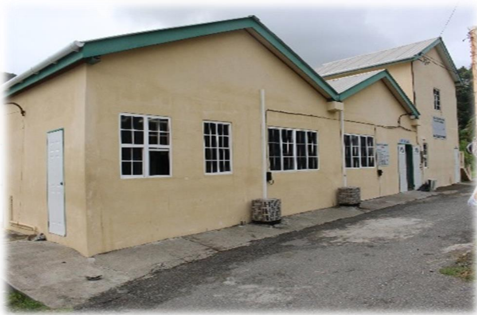
Figure: 6 Delaford Fishing Facility (Storage/Locker rooms)