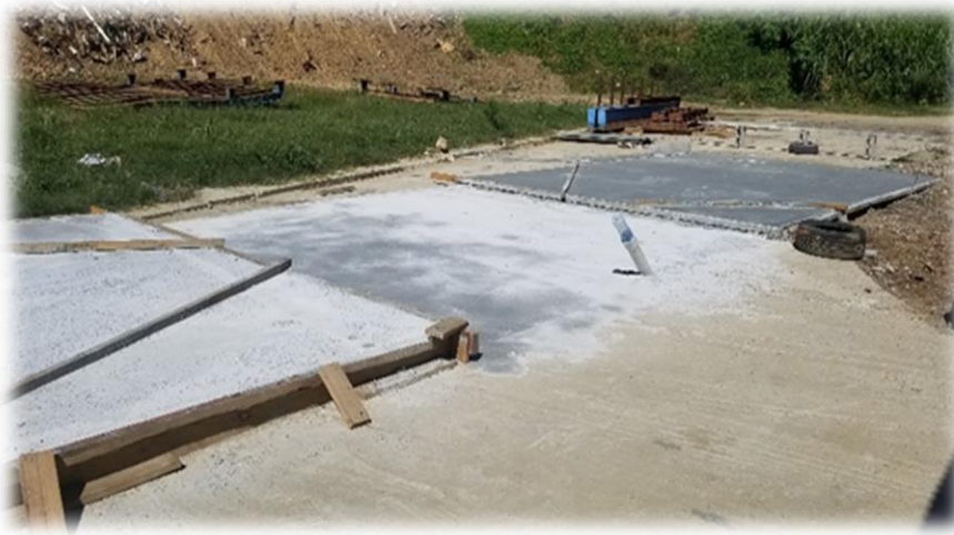
Figure 50: Relocated and Recalibrated Weighbridge

80. A number of projects were undertaken at the Studley Park Integrated Waste Facility in fiscal 2020 including the relocation, recalibration and expansion of the weighbridge, refurbishment of the main office and construction of an engineered cell. A total of $1.5 million was expended under this project.