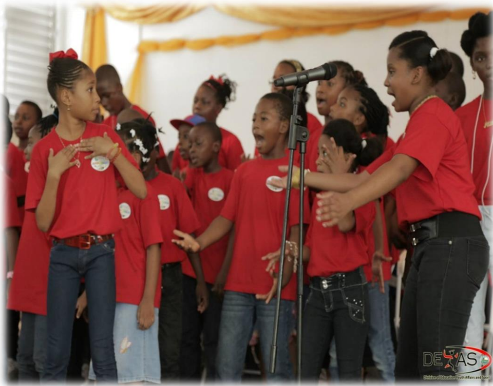
Figure 38: Folk Rendition – Hi! Song Theatre/Drama and Dance