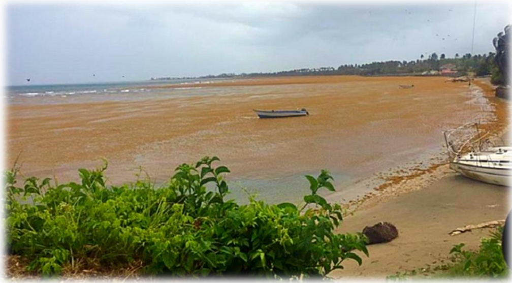
Sargassum returns to Tobago

observed in nearshore areas, particularly in Lambeau and Scarborough. In this regard, an allocation of $1 million will be provided in fiscal 2021 to commence activities for the Sargassum Response project to clear the beaches throughout Tobago.