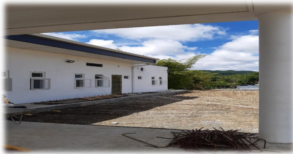
Figure 52: Moriah Health Centre Project (Exterior)