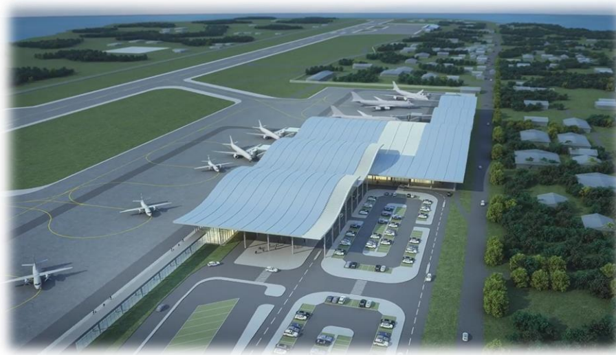
Figure: 59 Rendition of New Terminal at ANR Robinson International Airport

limited to approach, landing and take-off. It will also provide critical information on wind shear and relay this information directly to aircrafts to calibrate landing safety. Two contracts were awarded to foreign companies both of which are expected to be completed in fiscal 2021.