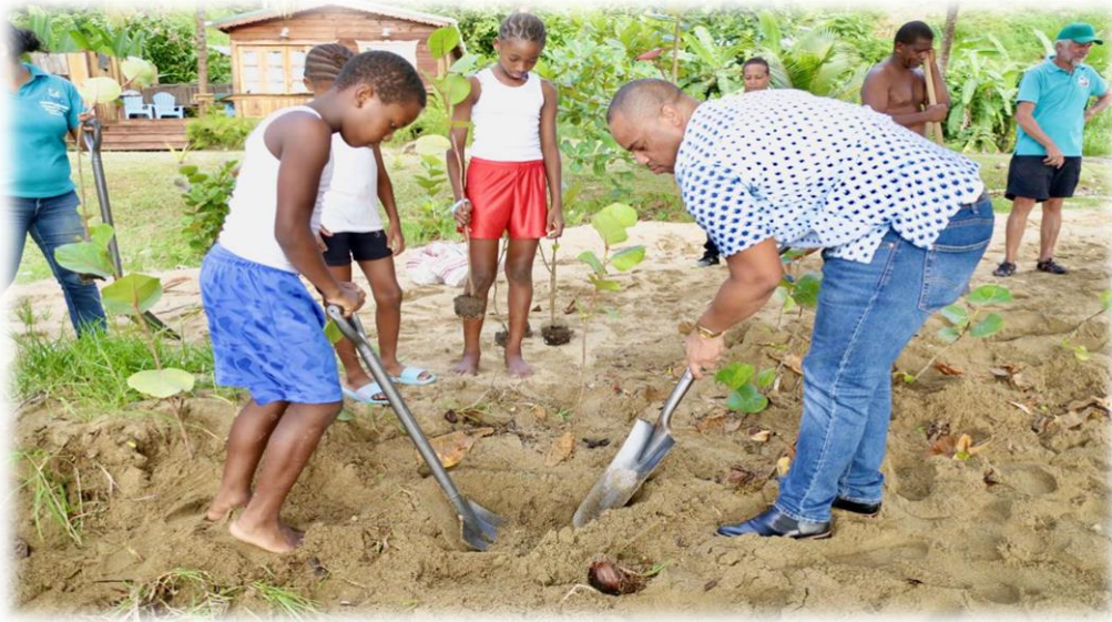
Figure: 14 Tree Planting Exercise in North East, Tobago