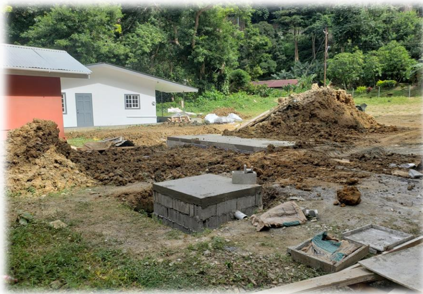
Figure: 20 Relocation of Septic System at Charlotteville Beach Facility

29. Charlotteville is situated on the north-eastern side of the island and plays an integral role in the tourism panoply. The village is known for its history and its heritage portrayed by the villagers in the annual Tobago Heritage Festival. In addition, the village is also known for swimming, snorkelling, and fishing. In fiscal 2020, the THA relocated the septic tank system at the Charlotteville Beach Facility. This system was reconstructed and is now functioning effectively, 90 percent of the contracted sum was paid and 10 percent was retained for a period of 12 months and is due for payment in January 2021.