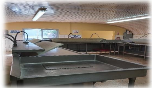
Figure: 5 Facility Preparation Area