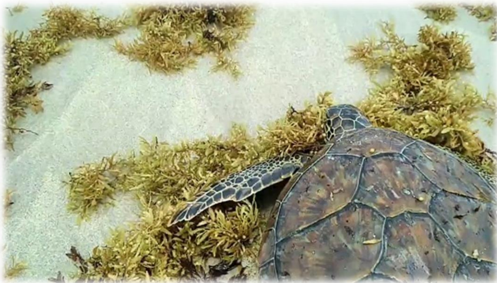
Disruption of Marine Life