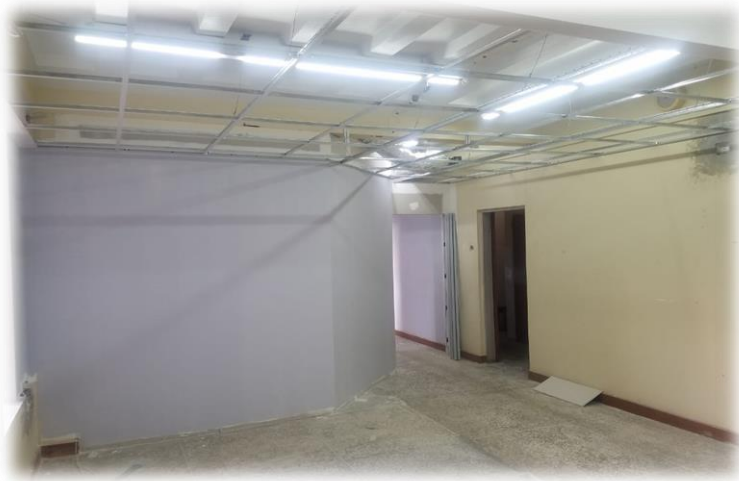
Figure 57: Installation of ceiling frames and painting works ongoing Legal Department