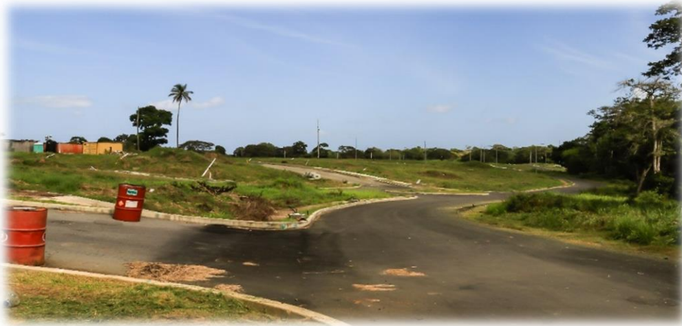
Figure: 42 Courland Estate Land Development – Infrastructure Works

63. Works are estimated to be completed in September 2020. Site clearance and surveying works are underway to allow for the preparation of Deeds of Lease for the potential homeowners.