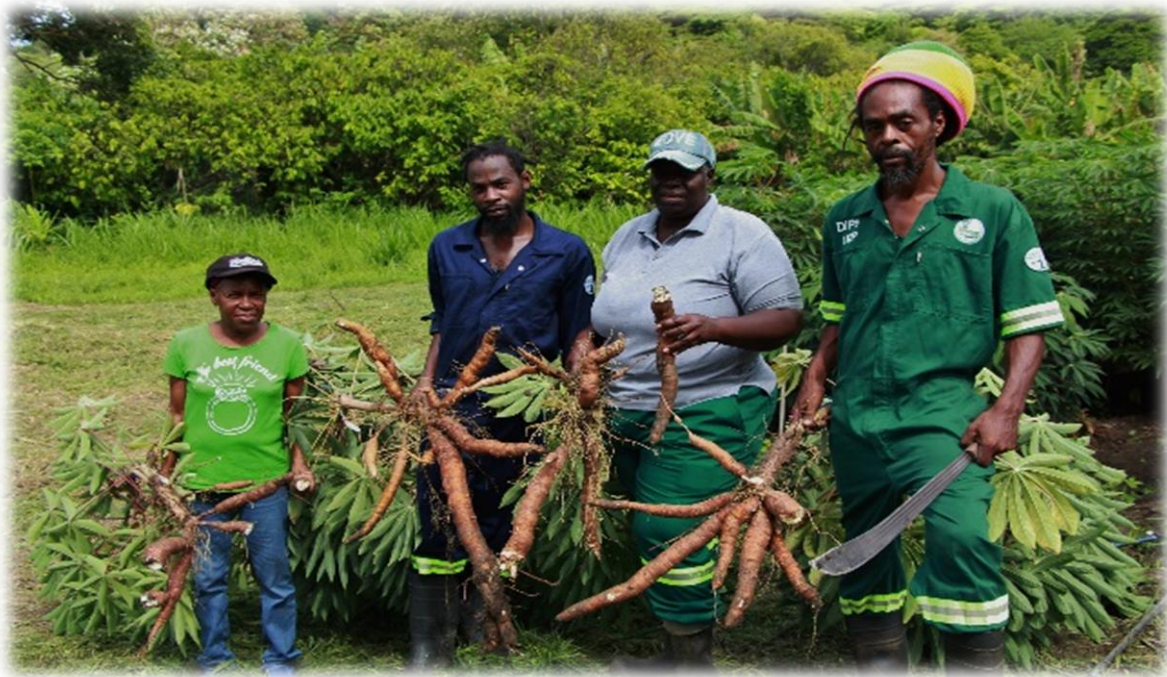
Figure: 9 Produce from cassava cultivation project