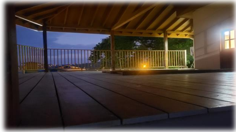
Figure 24: Work at Icons of Tobago Museum