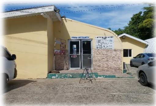
Figure: 1 Pigeon Point (front view)

15. In fiscal 2020, an overhaul was completed on the aeriated treatment unit system at Pigeon Point to allow for proper disposal of waste. Plans are being formulated to redesign and renovate the Delaford Fishing Facility to accommodate the smoking of fish and other related production activities.