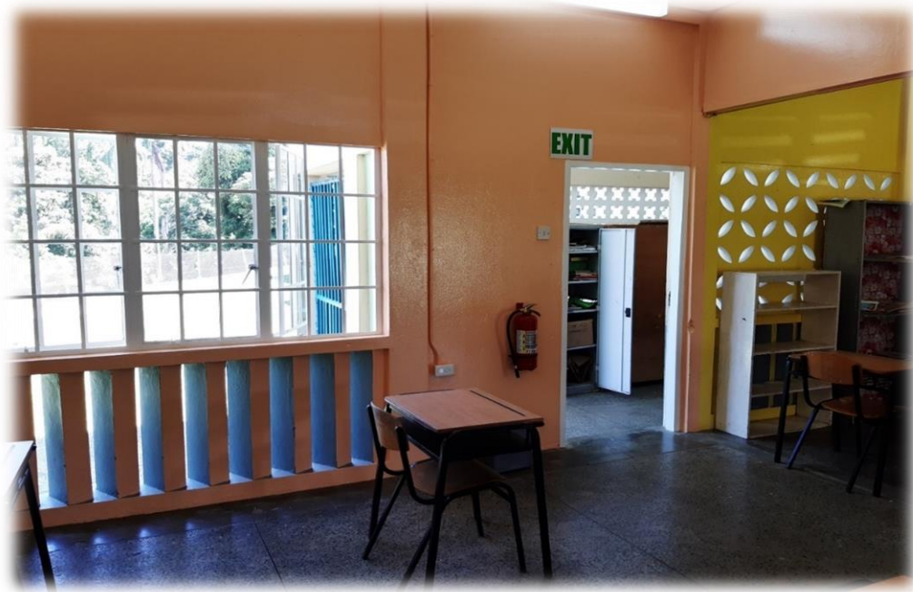
Figure 30: Painting Work at Patience Hill Government School