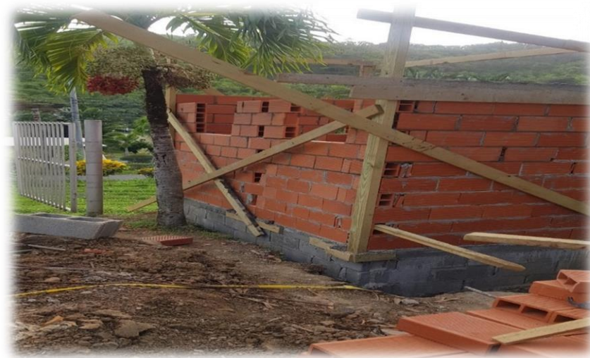
Figure 33: Construction of a guard booth at Delaford Anglican Primary School