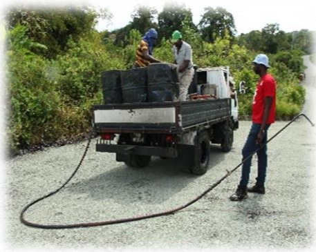
Figure: 10 Adelphi Widowers Lot